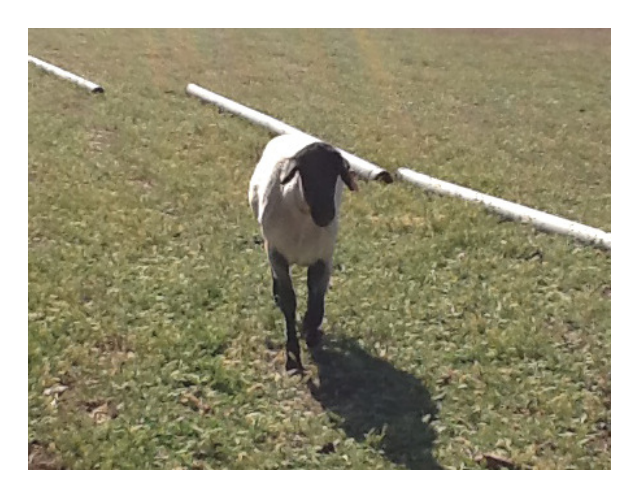
Left photo: Sheep waiting to be sheared. Right: A ewe after shearing. At this point, baby lambs can have a hard time recognizing their mothers because the identifiable scent of the wool is gone.