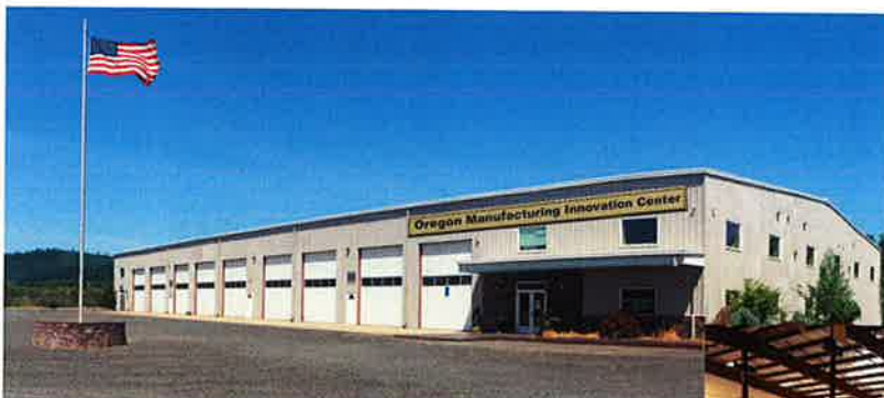
Figure B: OMIC R&D Facility in Scappoose, OR. Representative signage added.