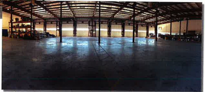
Figure C: OMIC R&D High Bay Interior View