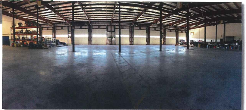
Figure C: OMIC R&D High Bay Interior View