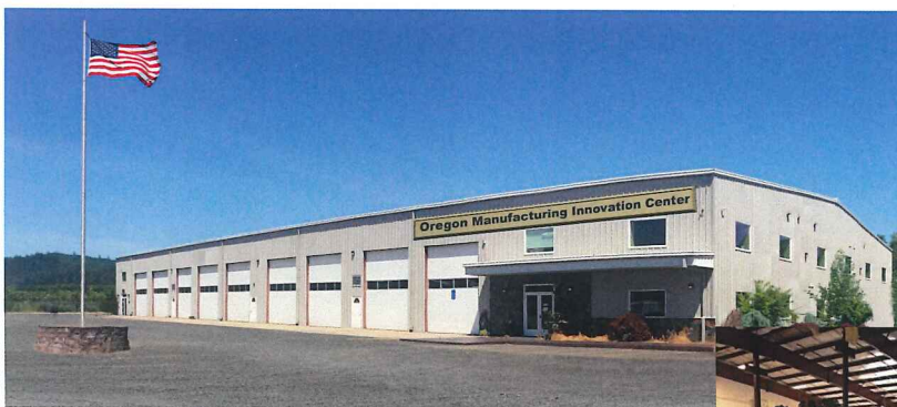
Figure B: OMIC R&D Facility in Scappoose, OR. Representative signage added.