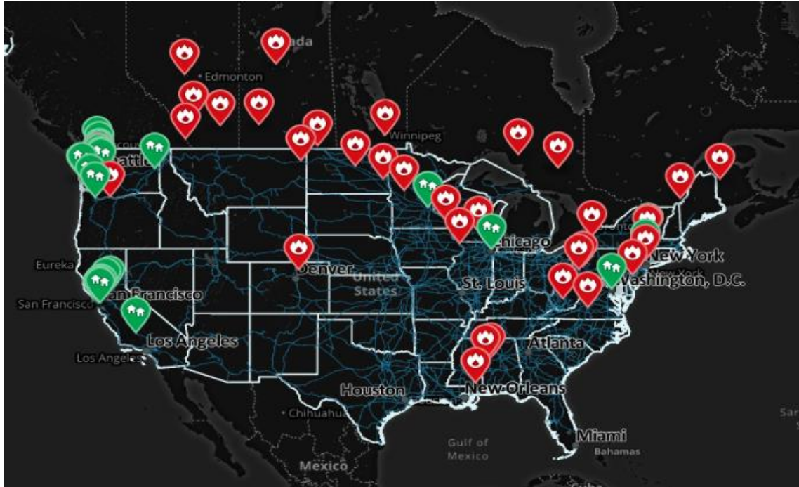
Oil Train Disasters: recent oil train accidents and communities fighting for protections. Blue lines indicate U.S. major freight rail lines. http://earthjustice.org/features/map-crude-by-rail

The Fraser Institute, a nonprofit think tank based in Canada, found that rail is “over 4.5 times more likely to experience an occurrence when compared to pipelines.”