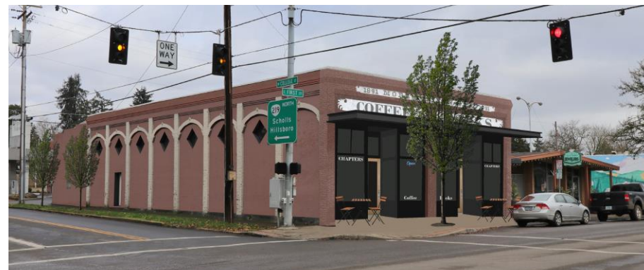
Newberg: Chapters Books Design Assistance