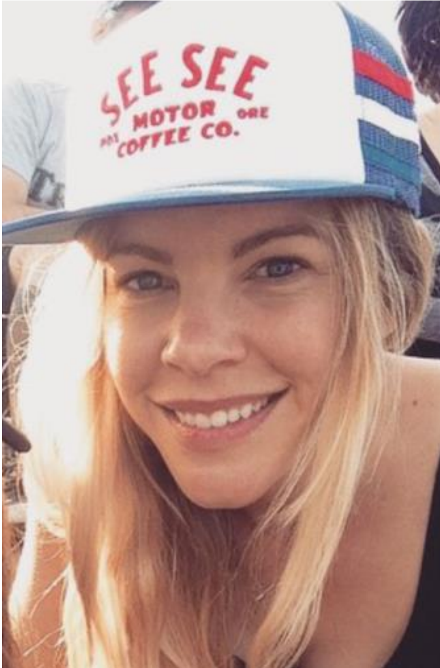
Pre vs. Post- Trauma