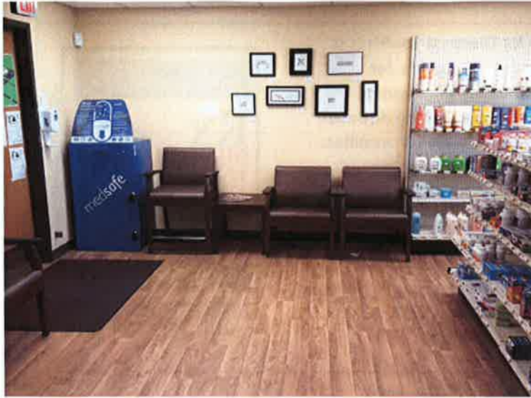
Pictured: Columbia Memorial Hospital's Outpatient Pharmacy