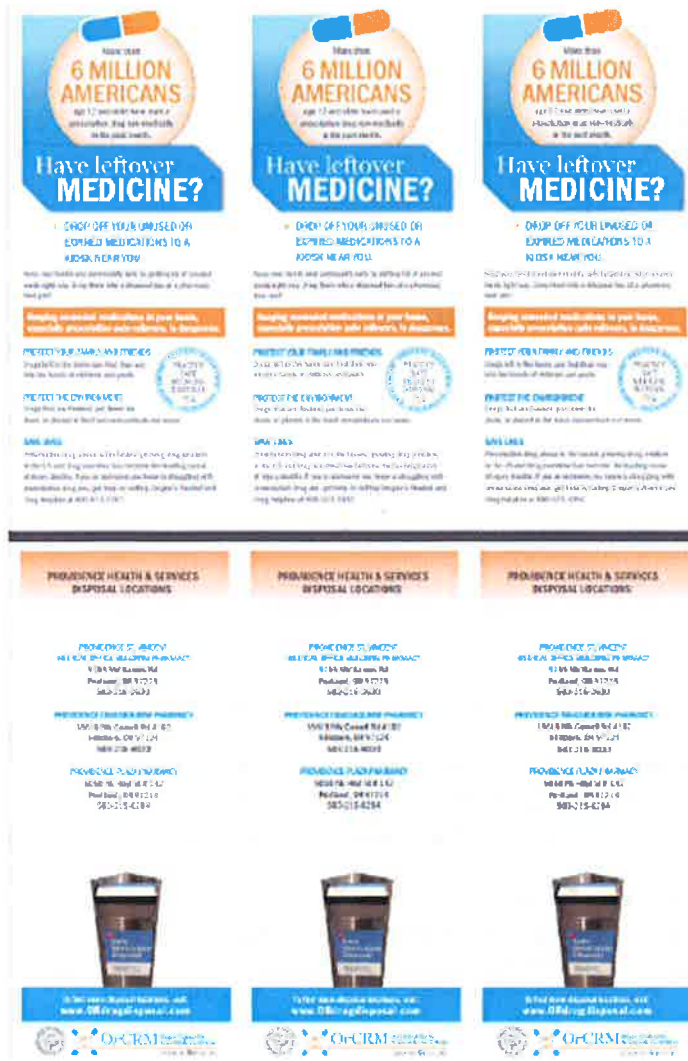
Example of “Bag Stuffers” provided to pharmacists to provide to patients when prescribing opioids.