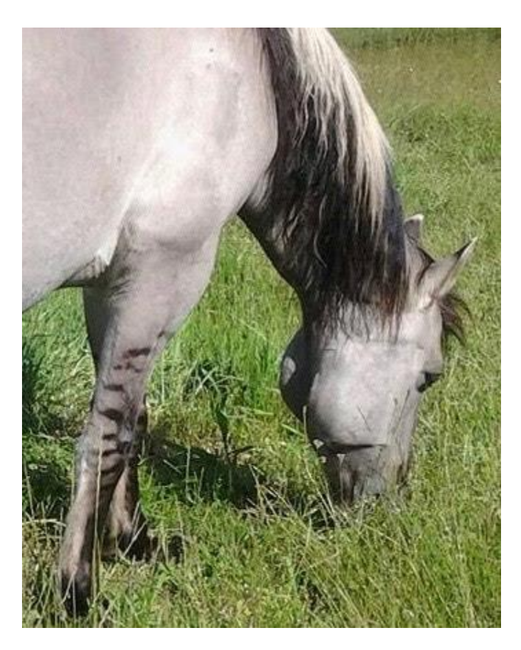
Kiger with bi colored mane and leg striping