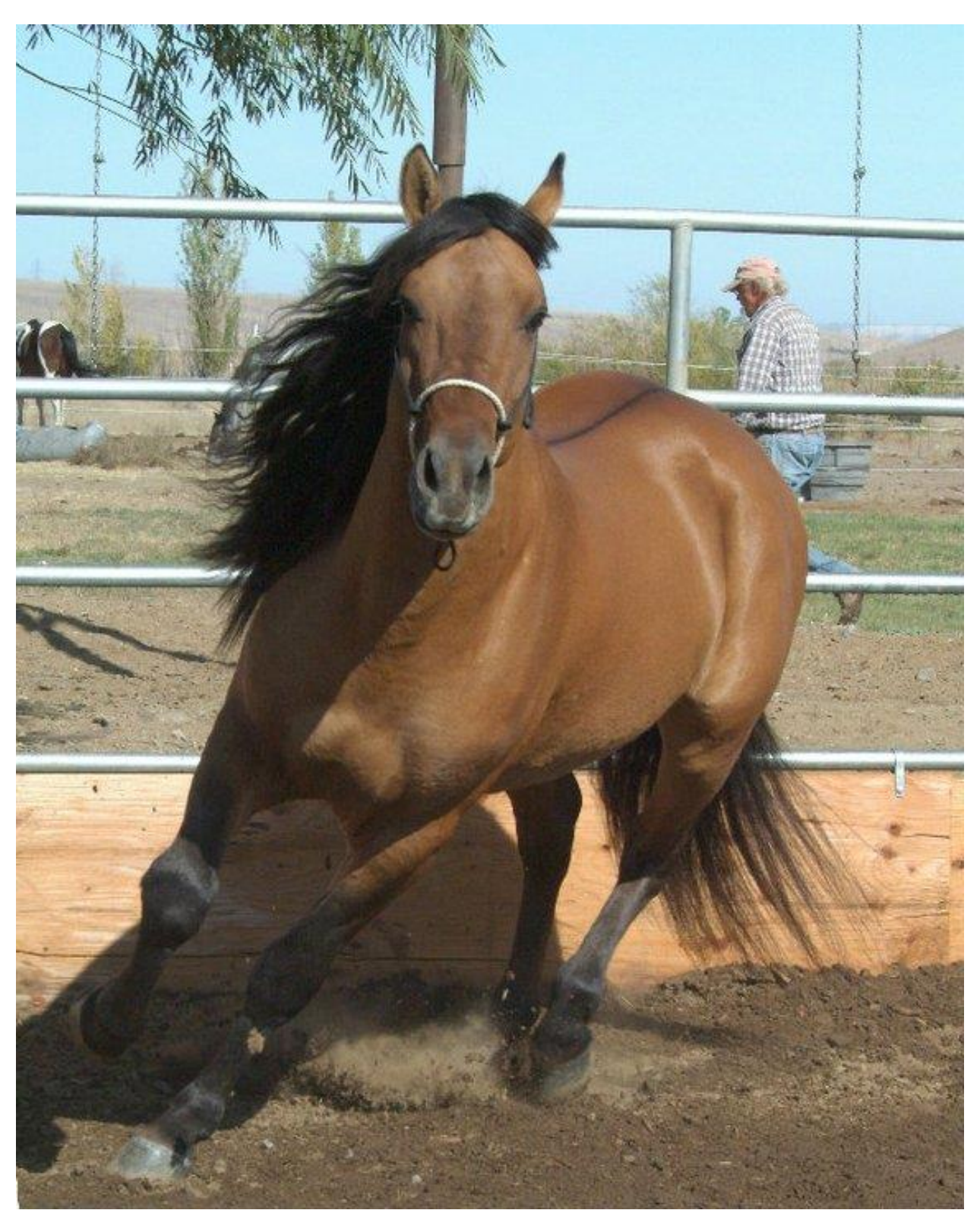
Kiger running (dorsal stripe)