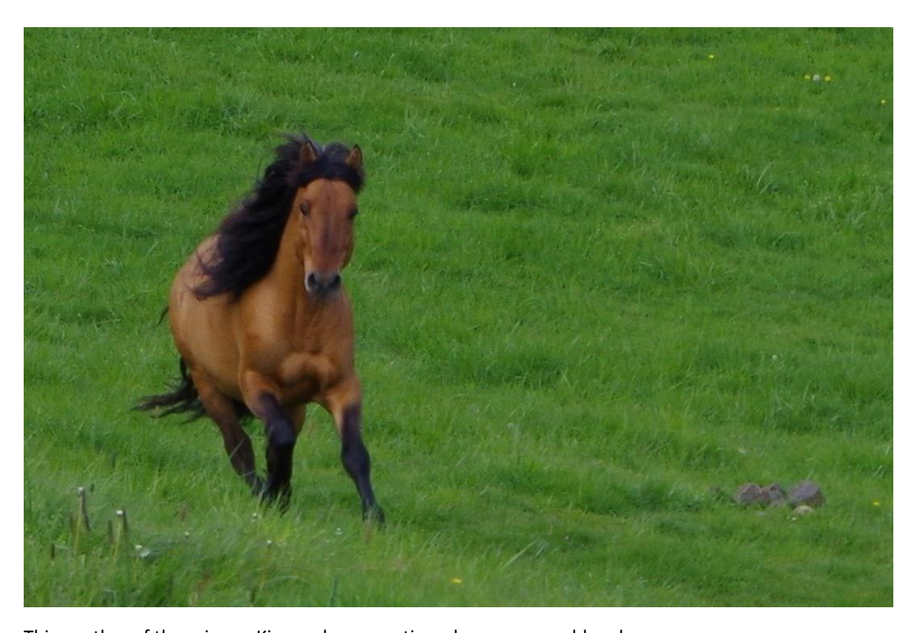
This another of the primary Kiger colors sometimes known as a golden dun.