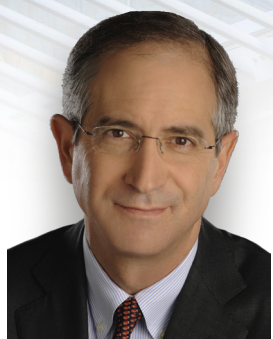
BRIAN L. ROBERTS CHAIRMAN AND CEO