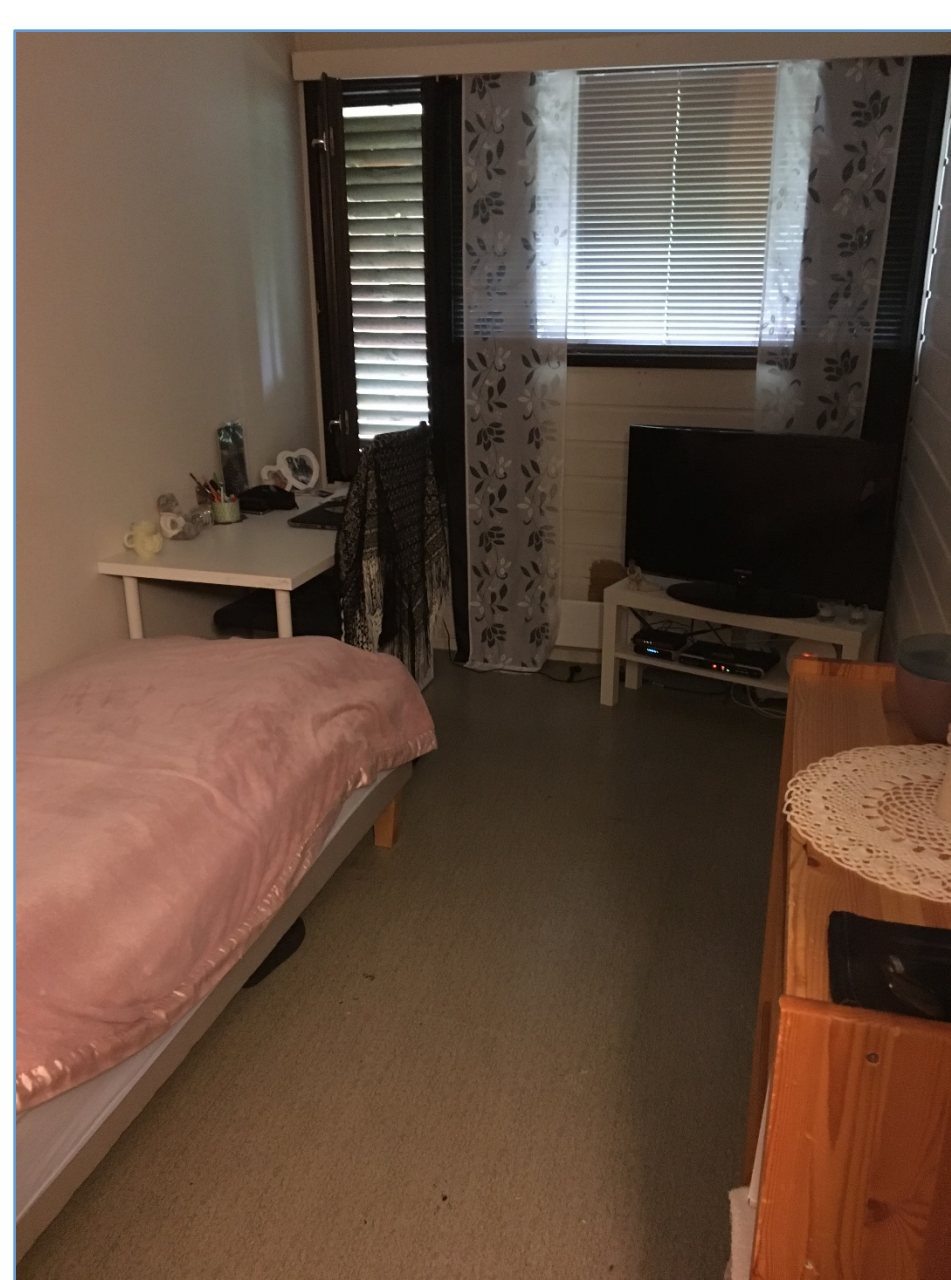
Sandaker Halfway House