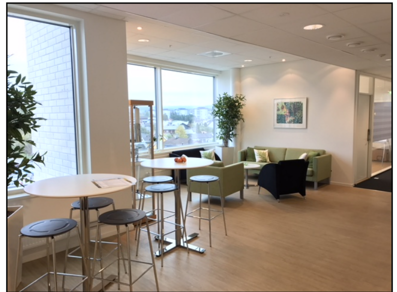
Staff Training Academy