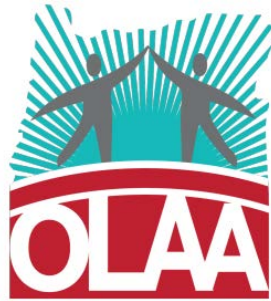
(Oregon Latino Agenda for Action)