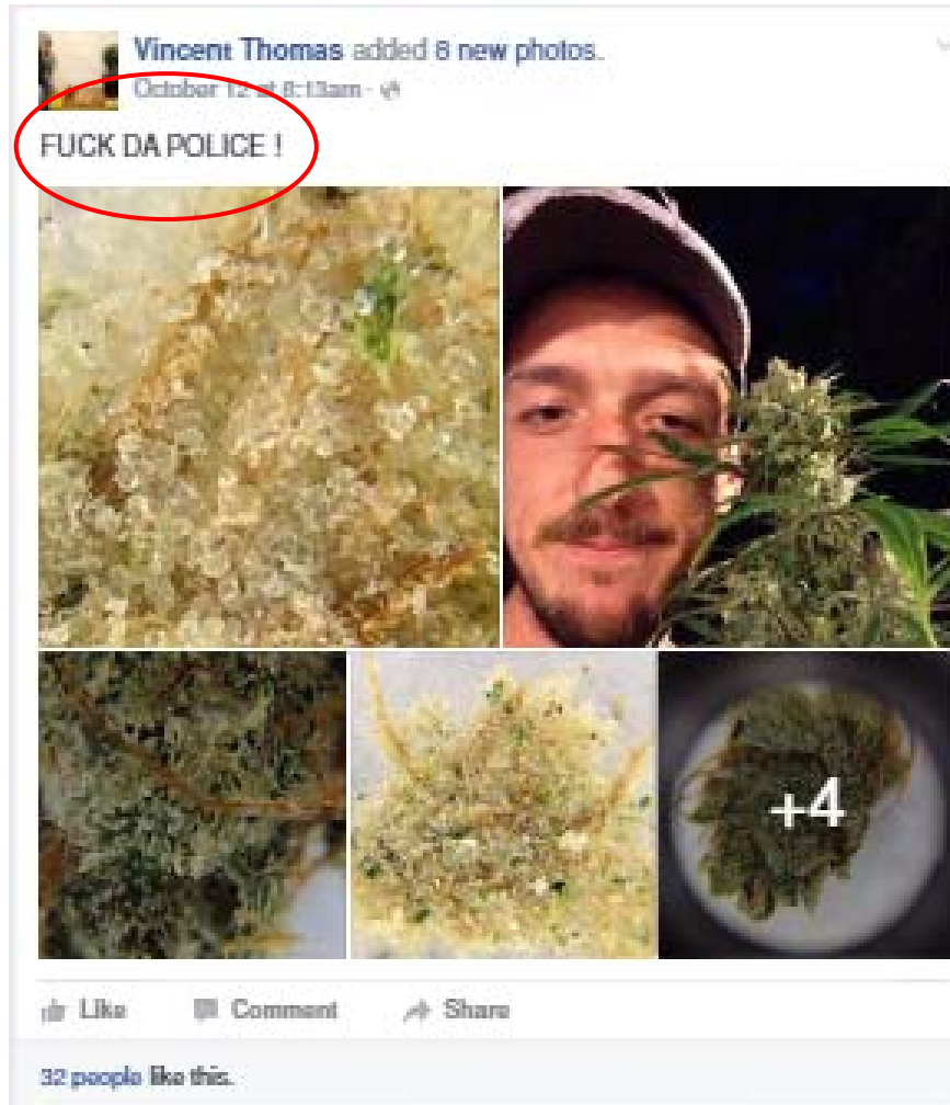
Exhibit 2: Herbaceous Farms Staff