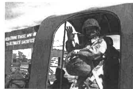
Colorado's Largest Memorial Day Parade

"All this stuff is good, potent, there's a mix of stuff in there," said the delivery man who claimed that everything was gourmet and made at a local kitchen.