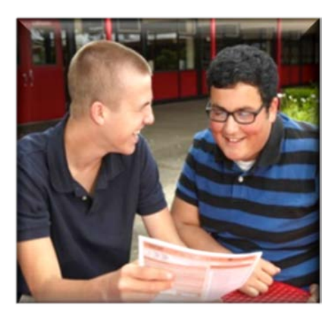
ASPIRE Community College

Group mentoring to middle school students