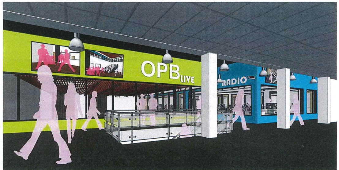
radio studios - 2nd floor