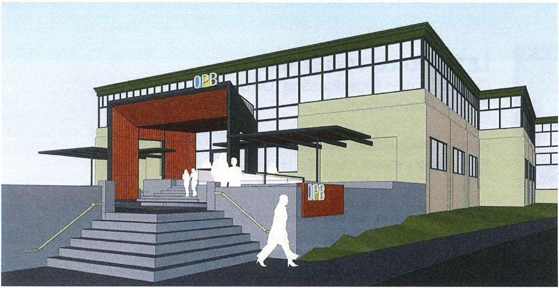
building exterior + canopy