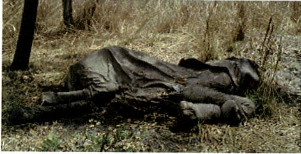
The carcass of an elephant killed for its ivory in Cameroon