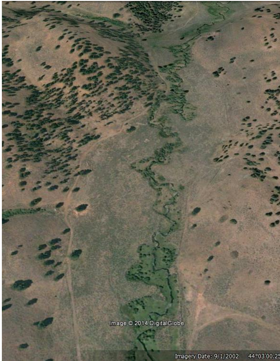
September 1, 2002