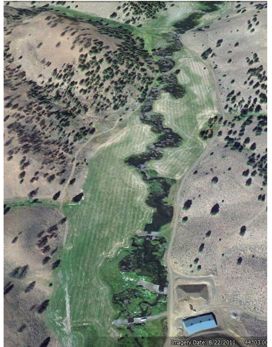
August 22, 2011