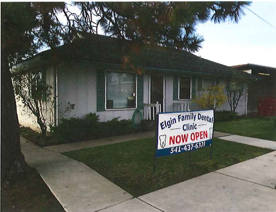
Below: Main entrance to medical and dental clinic