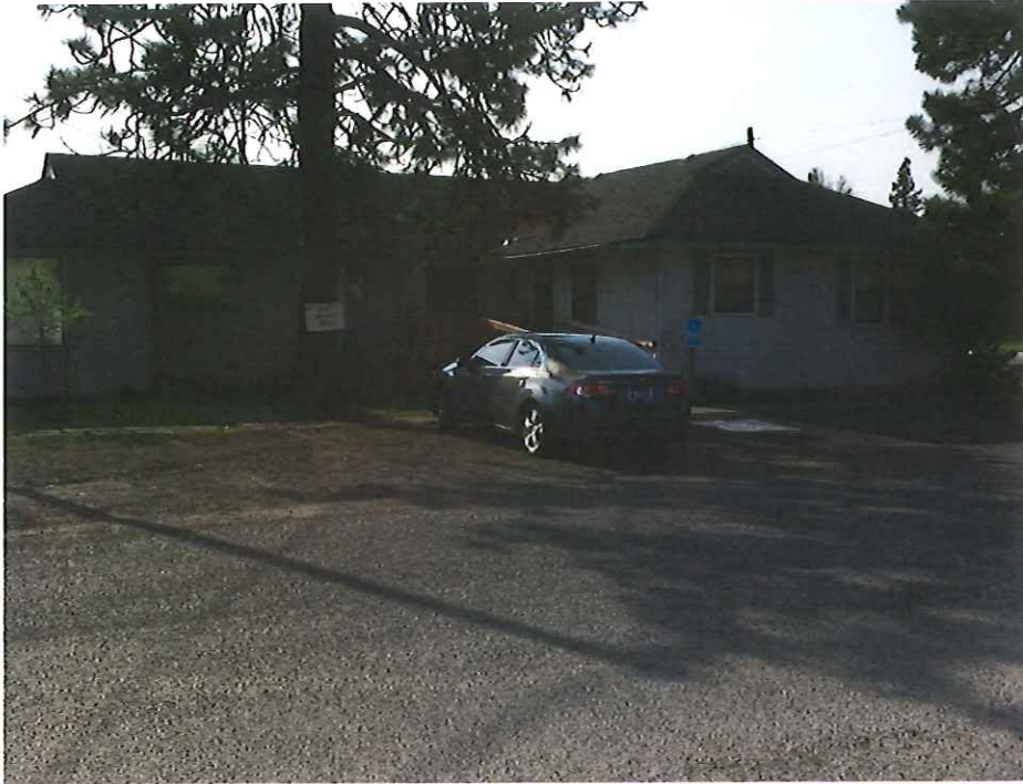
Above: Parking for clinic and handicap entrance. 1 handicap space and 4 car parking.

Below: Handicap parking, ramp, and entrance. This door enters through one of the exam rooms for medical. Serves all patients regardless of specialty they are seeing.