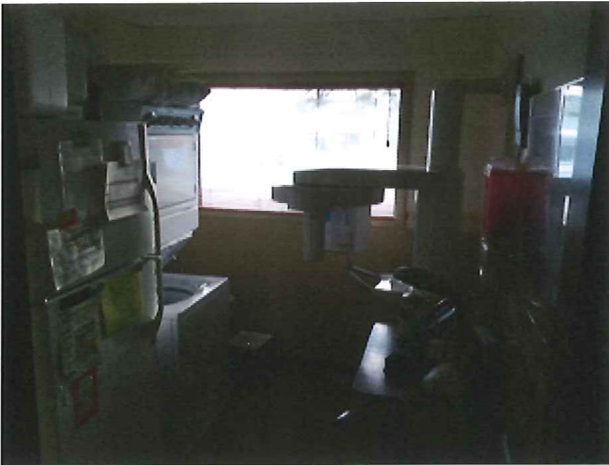
Above: Washer/Dryer, refrigerator for vaccines and refrigerated medical supplies, CT scanner for dental, Blood and lab draw station for medical.