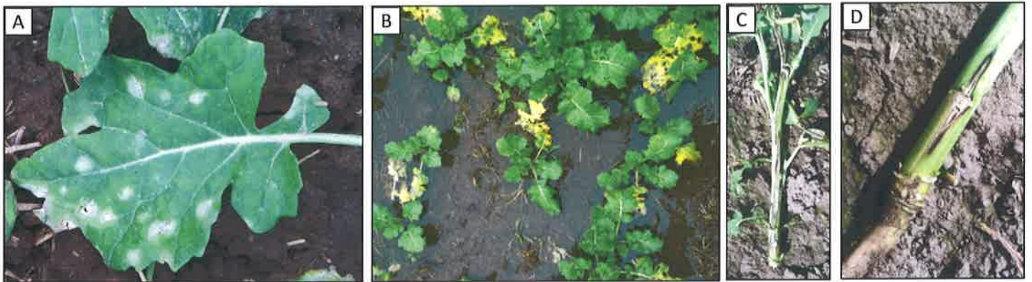
Fig 2. Canola with black leg in December 2014 (A, B) and April 2015 (C, D) growing in commercial fields that part of the OSU canola research in the Willamette Valley.