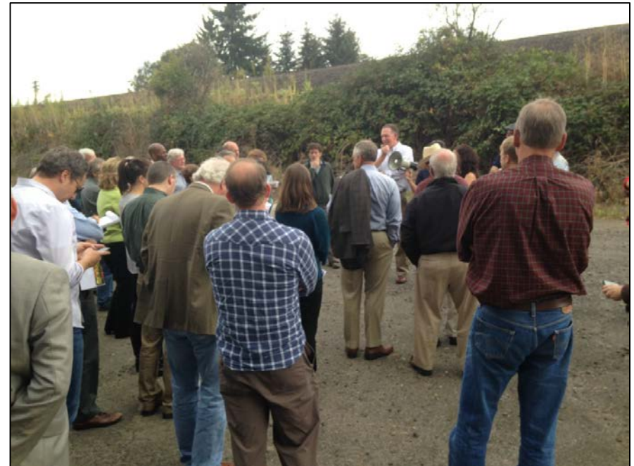
Oregon Solutions partners on a tour the levee system.