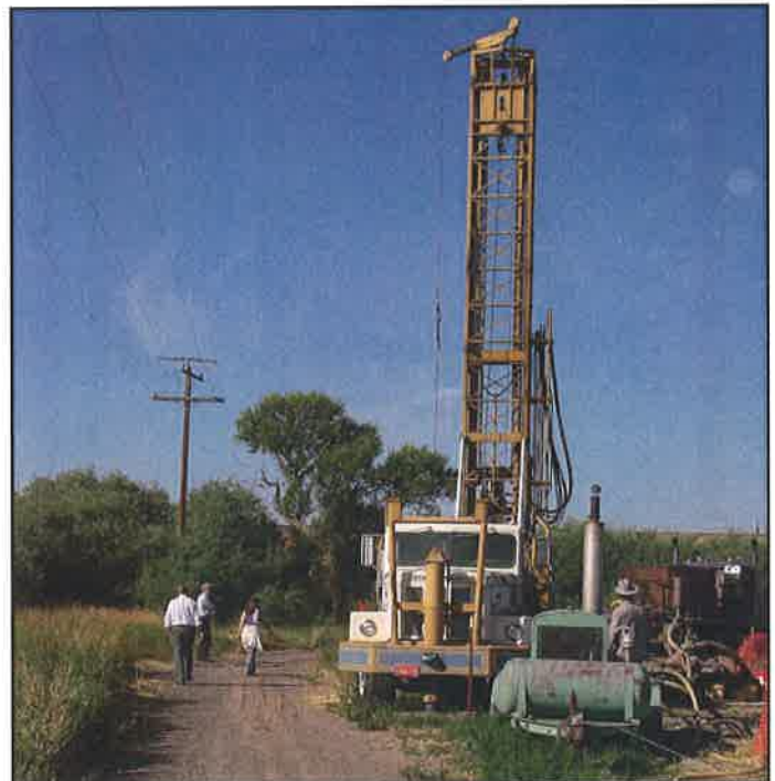
Klamath County drilled a new injection well for geothermal heated water that heated Henley High School. The project was paid in part with Recovery Act (stimulus) funds.

...the funds saved will pay for a full-time teacher.