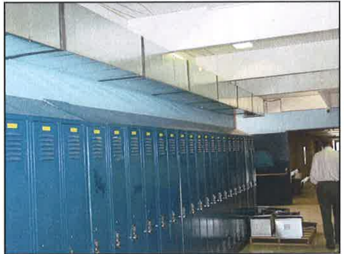
Klamath County School District installed new ducts at Henley High School and added insulation to the exterior walls and ceiling to reduce heat loss to the building constructed in 1968.