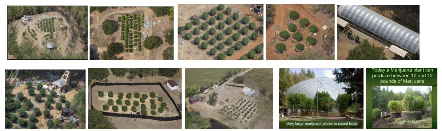
Many of these plants can be from 15' to 22' tall and require a chainsaw to cut them down

http://www.oregonlive.com/mapes/index.ssf/2015/03/medical marijuana growers may.html