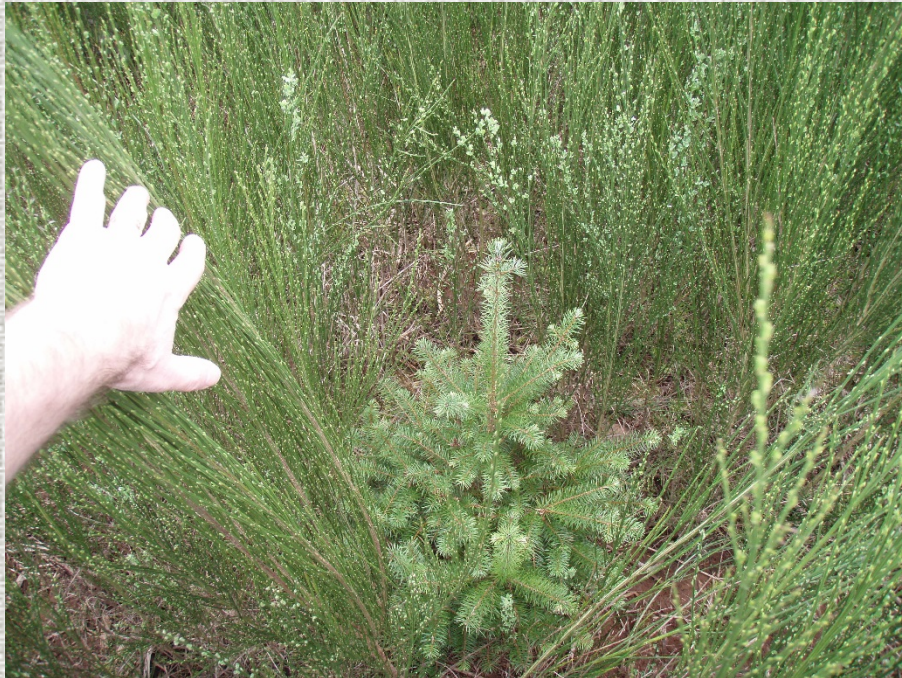
Conifer seedling surrounded by Scotch Broom – no herbicides applied