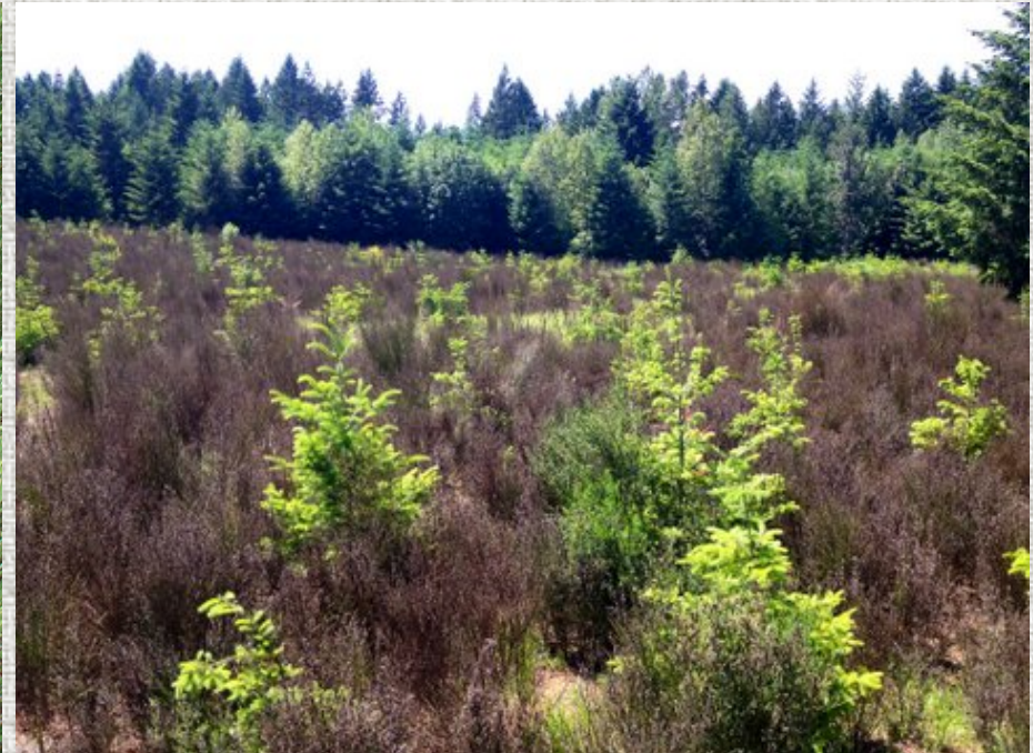
Conifer seedlings surrounded by Scotch Broom – herbicides applied