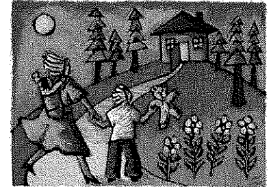
Formerly Mid-Valley Women's Crisis Service