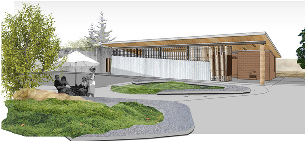
Architect's rendering of a new visitor's center at the Oregon Zoo. The large slab on the roof is cross-laminated timber.

The first grant application sponsored by PNMP for federal assistance under EDA’s Economic Adjustment Assistance Program has been submitted by Oregon BEST as the applicant. This effort serves as a case study that demonstrates the value of the partnership’s maturing collaborative process and commitment to work together to make catalytic investments within the manufacturing ecosystem. The $200,000 project called, “Advanced Wood Products Manufacturing Study - Cross Laminated Timber (CLT) Acceleration in Oregon and Southwest Washington,” will study a variety of aspects essential for the region to play a significant role in the adoption of CLT in the building industry. It will examine the raw material resource, the manufacturing capacity, the capital expense to start up a manufacturing line, the workforce training needs and the market barriers and opportunity. PNMP provided assistance with grant writing and securing matching funds from Oregon BEST, Business Oregon, OSU, Woodworks, City of Eugene, Clackamas County, City of Corvallis, Benton County, and the Oregon Department of Forestry.