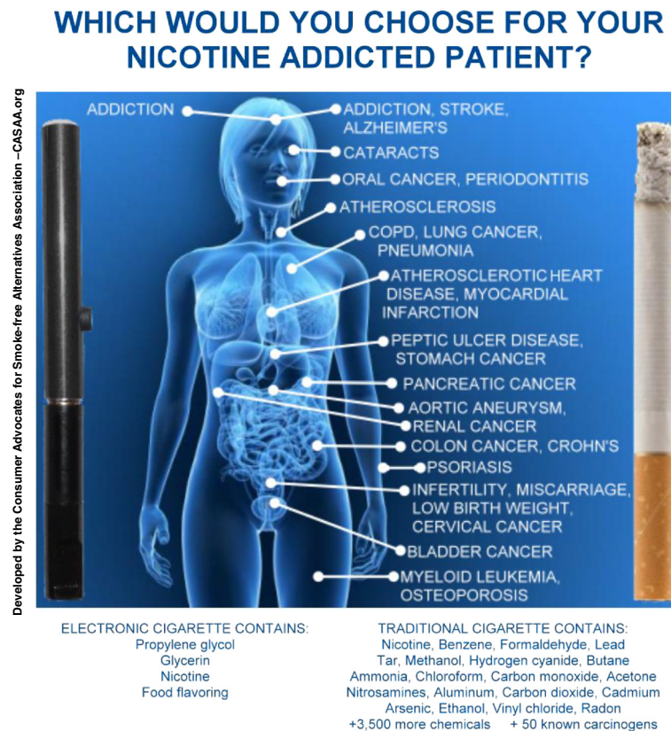
Figure 3 Medical Infograph. This Infograph compares the potential health risks of cigarette smoke with the health risks of vapor. Since e-cigarette liquid contains only propylene glycol, vegetable glycerin, flavorings, and nicotine, the resulting vapor is unlikely to present any more disease risk than medicinal nicotine products -- the risk of nicotine addiction. The many more toxic and carcinogenic ingredients in tobacco smoke are linked to numerous health problems.

With the excuse of safeguarding public health and guiding regulatory strategies, extensive research on product design, toxicant exposure, abuse liability, youth initiation, and influence on cessation efforts has been advocated [91]. Thus it appears that the same tactics that are being used to keep less hazardous products such as snus from being widely adopted by smokers are being used