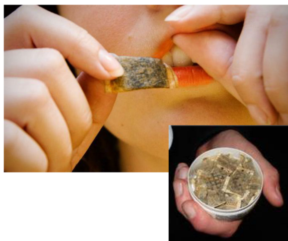
Figure 1 Snus smoke-free tobacco. Snus is an oral tobacco product that comes in a pouch of some sort, designed to be placed between the gums and upper lip. Snus is not chewed and requires no spitting. The standard pouch holds 1 gram of finely ground tobacco. Snus is regulated as a food in Sweden, and thus held to strict quality standards. Swedish snus was developed to greatly reduce TSNA content, and research shows that snus does not increase the risks of cancer of any type.

The issue of abuse liability has been recently used by opponents of THR to warn about potential risks of smokeless tobacco products. Hatsukami et al. [52] concluded that smokeless tobacco appears to have slightly lower abuse liability, with possibly lower severity of addiction or dependence compared with smoking and greater ease of cessation. They also concluded that it may be possible that switching from cigarettes to smokeless tobacco would increase the potential for cessation from all tobacco products. Fagerström and Eissenberg came to similar conclusions in a recent comparison of dependence among smokers, smokeless tobacco users and users of medicinal nicotine [53]. Many former smokers in Sweden have quit through using snus, suggesting it may be a more