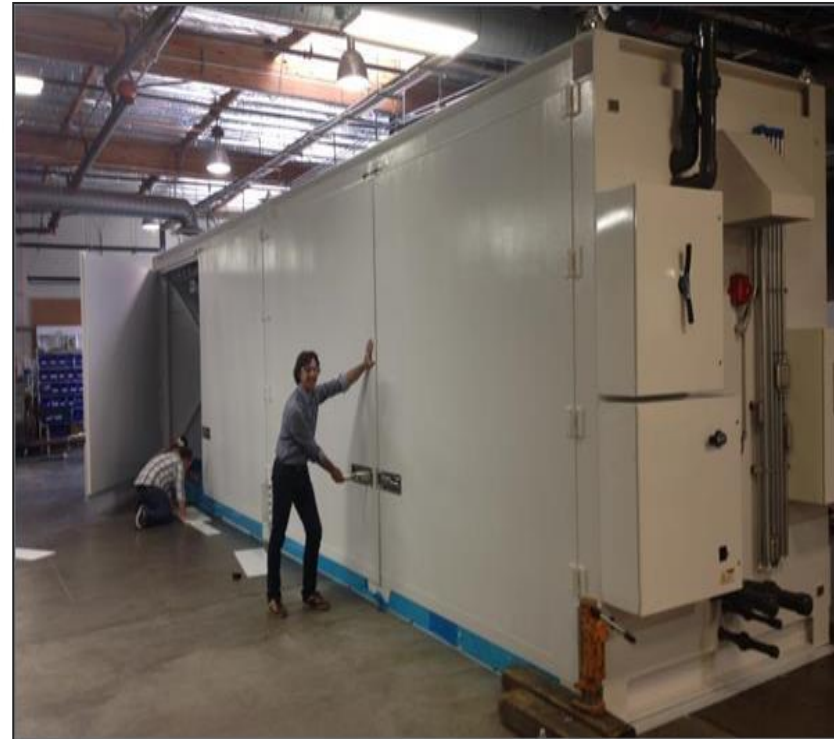
Primus Energy Pod