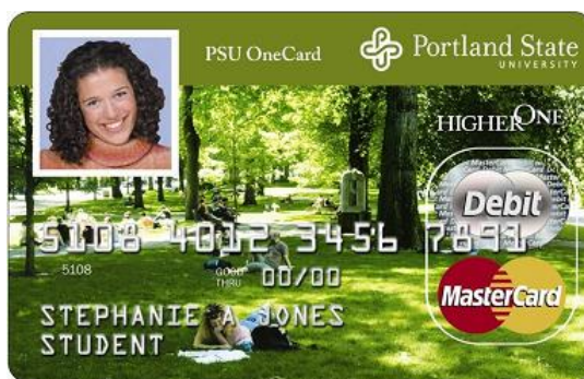
Figure 2: Cobranded Portland Student ID/Debit Card

The student ID card that Fullerton provided to all students was cobranded with the U.S. Bank logo on the back, as shown in Figure 3. The card could function as a prepaid on-campus purchase card (“TitanTender”) and as a debit card connected to a U.S. Bank checking account. Although both of these card functions were optional, Fullerton officials said that students sometimes misunderstood how the two accounts worked and whether the checking account was required.