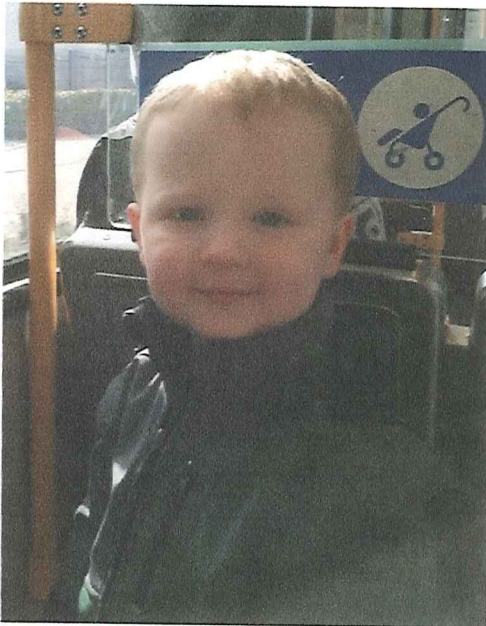
First Day of School – MAX ride ☺

Every child needs supports to learn. Some children with disabilities may need different supports to catch up to their peers, family and friends. EI/ECSE gives children with disabilities and their families the support they need to enter kindergarten ready to learn.