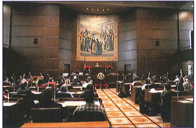
Oregon Civics Conference