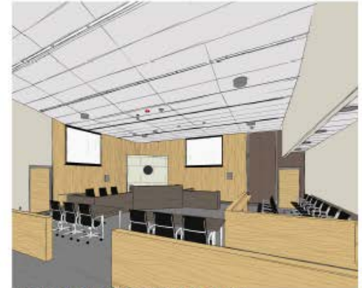
COURTROOM 3 LOOKING WEST (FUTURE PHASE)