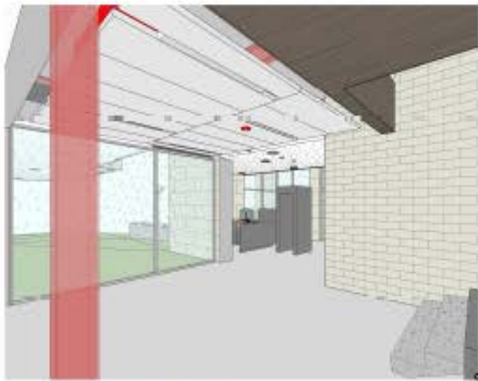
SERVICE LOBBY LOOKING NE