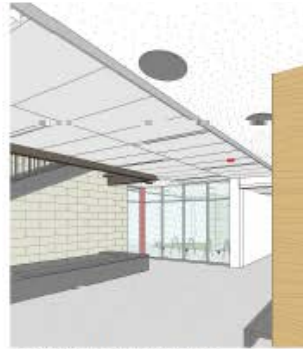
SERVICE LOBBY LOOKING SE