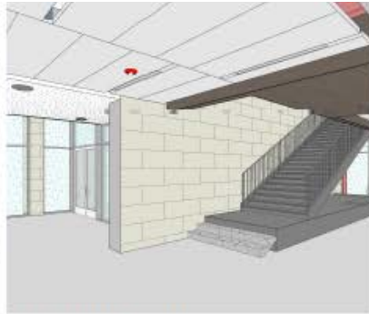
SERVICE LOBBY LOOKING EAST