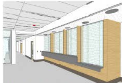
SERVICE LOBBY LOOKING SOUTH