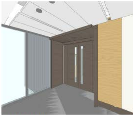
COURTROOM 3 ENTRY