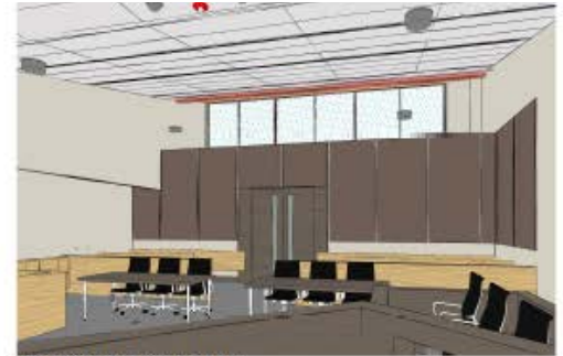
COURTROOM 3 LOOKING EAST