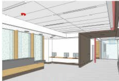
SERVICE LOBBY LOOKING NW