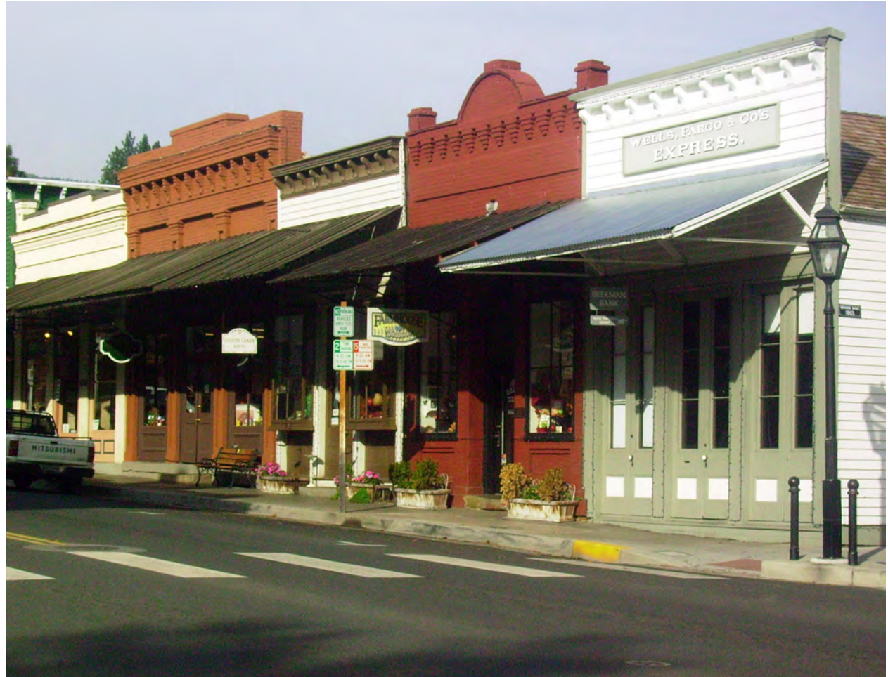
These picturesque storefronts in Jacksonville could collapse in a major earthquake. The proposed rehabilitation incentive could be used for seismic upgrades.

There are also net fiscal impacts. State and local government revenues from active construction, on a net basis, will range from $2.1 to $2.8 million. Government will also see higher property tax receipts, which are not included in the IMPLAN results on Table 2, from the investments in building rehabilitation. Such work enhances the value of structures put in place and a large portion of that is subject to property taxation.