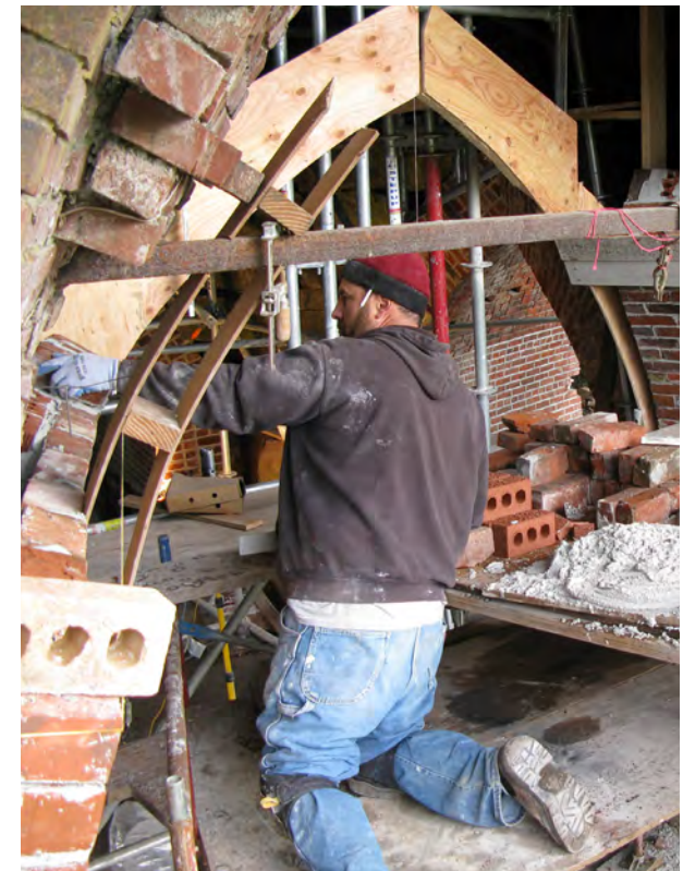
Restoring the historic arch in Lake Oswego's Iron Works.

For this analysis, ECONorthwest assumes the Oregon HRI goes into effect on January 1, 2016 and our projections run through December 31, 2025.