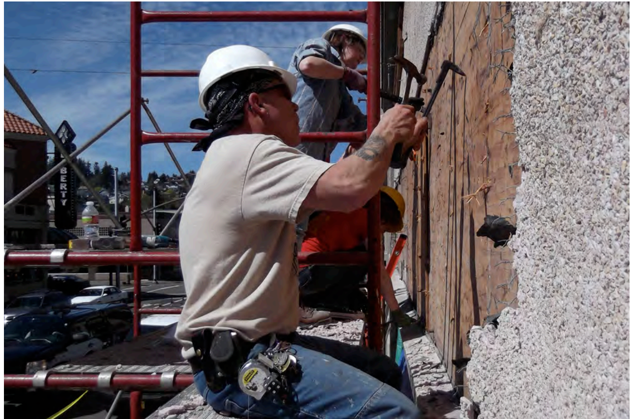
Facade restoration in Astoria's historic downtown.

Gross direct output is total spending in Oregon on rehabilitation projects using the state HRI. The calculation begins with the $22.3 million that would be spent anyway in Oregon on federal HTC rehab projects, even if there were no state HRI. We add to that the increase in federal HTC rehab spending that Oregon would attract if it has an HRI in 2018. That is an additional $78.4 million. Finally, owners of projects that do not qualify for the federal credits will use the state HRI and spend about $1.8 million on them. The sum is the gross output of $102.6 million. 18