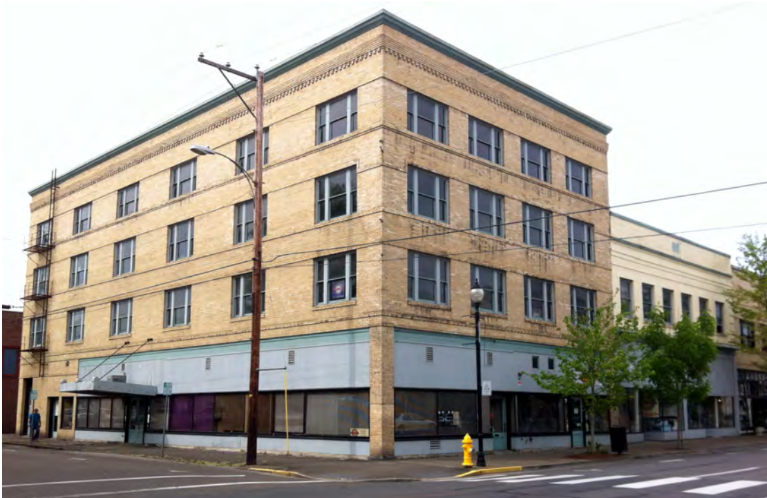
The St. Francis Hotel is a cornerstone of Albany's Main Street, but will continue to sit largely empty and deteriorating without a state rehabilitation incentive.