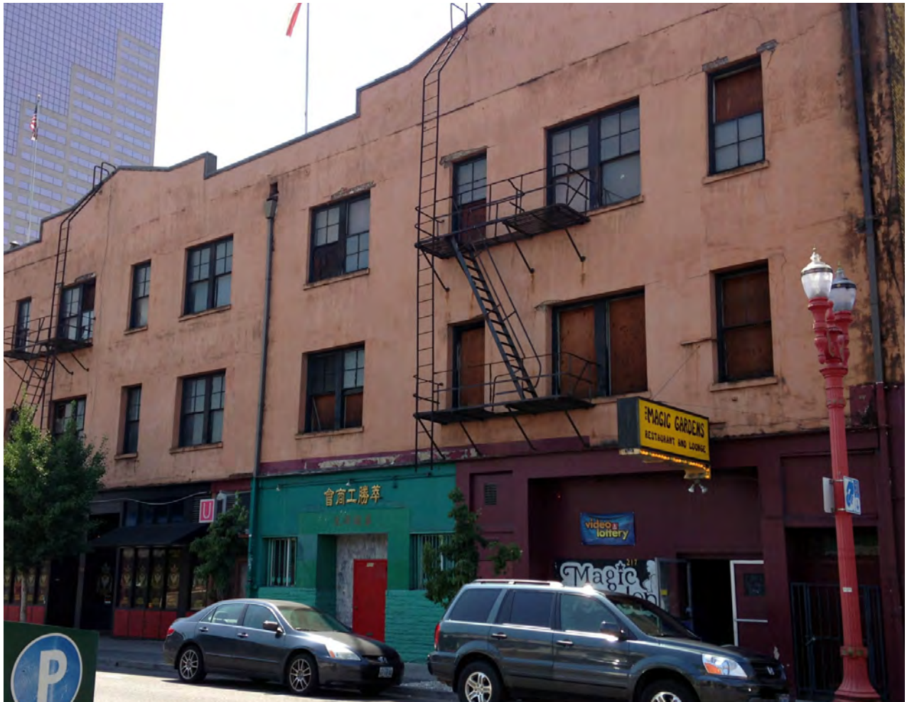
Empty upper floors and shuttered storefronts present opportunity in Chinatown, Portland.

We forecast the number of projects in Oregon under the HRI using the analysis of National Park Service