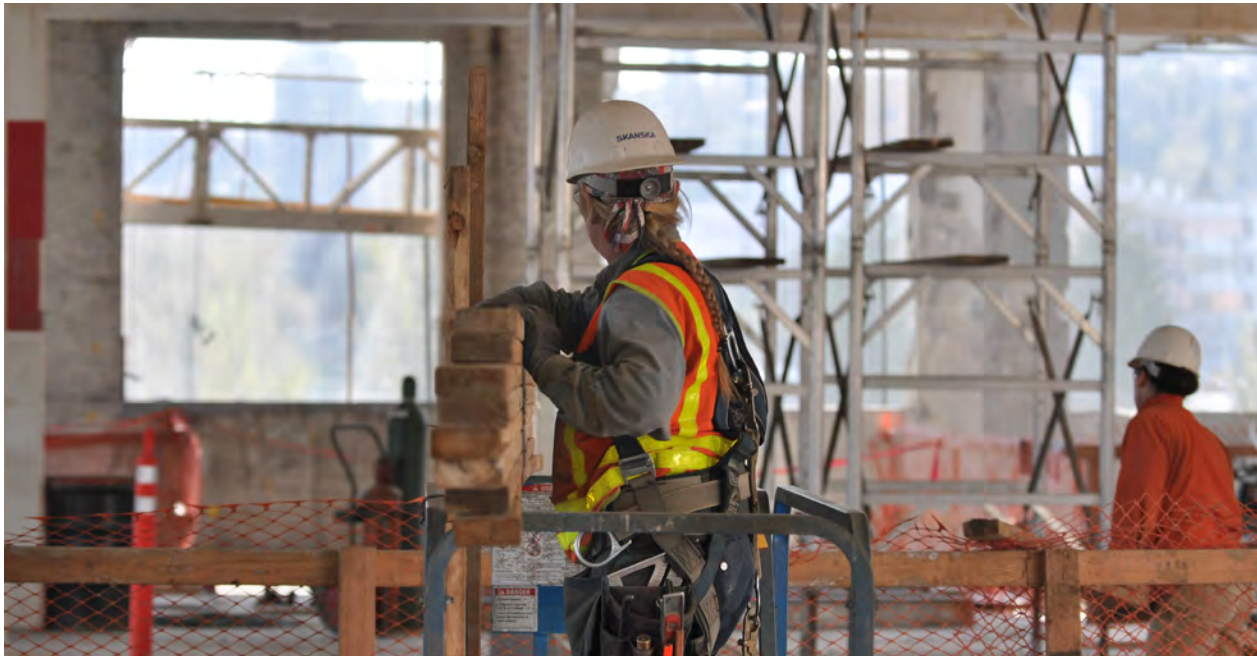
Workers convert a long-empty warehouse into modern office space.