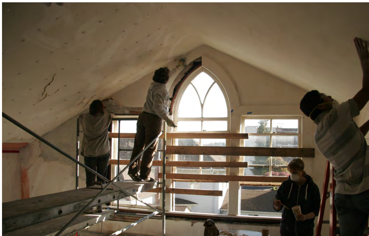
Clatsop Community College students learn how to restore historic plaster.

Although Oregon lacks a state HRI, building owners use federal historic tax credits, albeit at a low level. Oregon averages about seven projects a year. In the last twelve years, about two-thirds of the federal HTC projects were in Portland. The rest were in other cities throughout the state including La Grande, Medford, Roseburg, Condon, North Bend, Albany, Salem, Ashland, and The Dalles. The average historic development project in Oregon costs $7.2 million, of which nearly $6 million qualified for the 20 percent federal tax credit.