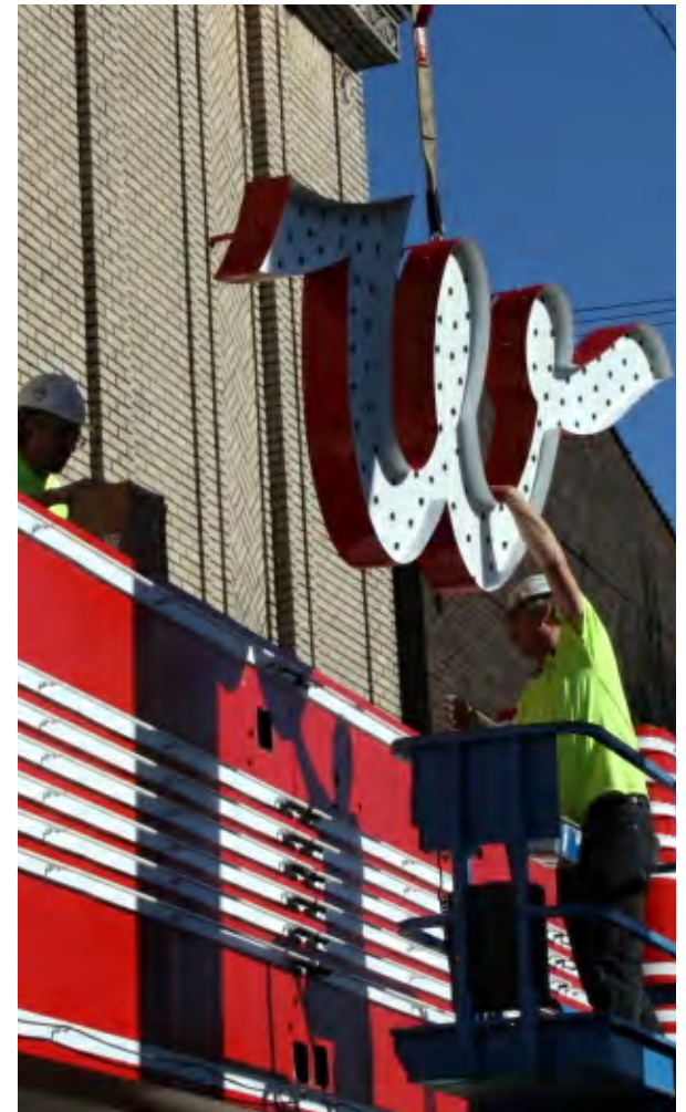
Whiteside Theater Marquee, Corvallis.

IMPLAN measures one-year economic impacts. Some effects of the proposed state HRI are ongoing and forecast separately from IMPLAN. An important impact is property tax , which appears in Table 3. ECONorthwest calculated the property taxes that finished rehabilitation work generates.