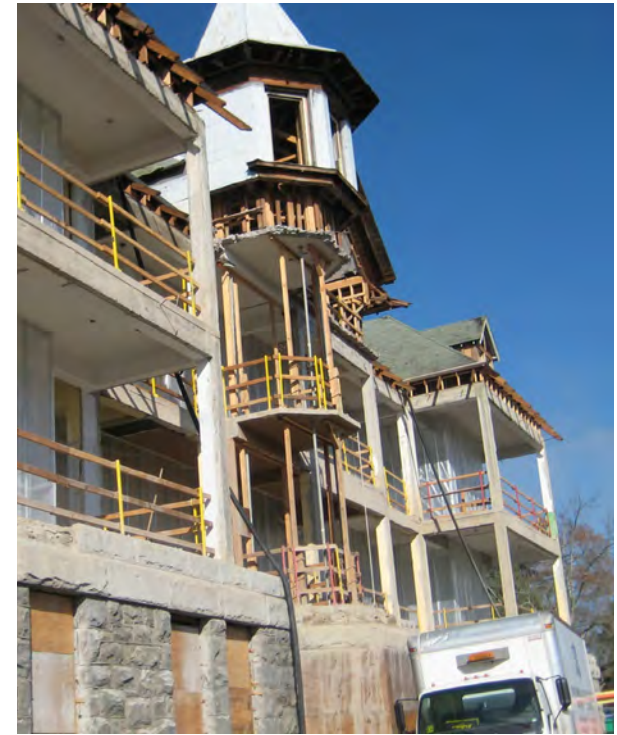
Construction on Furman Hall, Oregon State University.

Thus the net direct impact is $35.8 million. Out of the entire $102.6 million in rehabilitation spending using the state HRI during 2018, the net direct impact is slightly more than a third of that. This is money building owners will spend in Oregon that otherwise would not have been spent in the state but for the availability of an HRI.