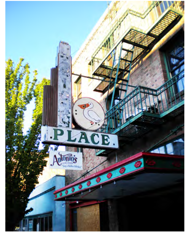
Empty storefront with potential upper story apartments awaits restoration in Klamath Falls.

ECONorthwest analyzed hard economic data originating from federal government sources and primarily from the IRS. Our analysis was rigorous and unbiased. Although, clearly in gross impact terms construction spending results in many jobs, we were initially skeptical that the HRI would support job growth in net impact terms. However, the analysis demonstrates, and by a substantial margin, that indeed the proposed HRI would result in Oregon having more employment, higher payrolls, and greater net economic output. The HRI would be clearly a net plus for the economy and, as designed, the traditional main streets of towns throughout the state would capture many of those impacts.