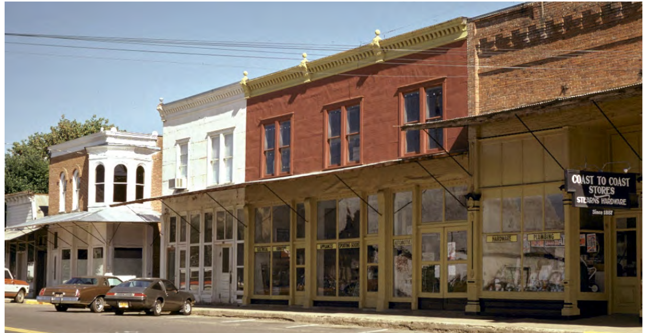
Historic buildings in Oakland need repair, seismic upgrades, and vacant upper floors made code compliant.

Thus, gross impacts measure all the effects stemming from HRIs regardless of the origin of the funds or the effects of having or not having a state HRI. Net impacts measure how much more economic activity goes on in Oregon because of the HRI, compared to an economy