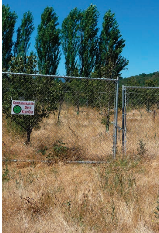
Former Sunnybrook Hop Farm Grants Pass

In 2013, Business Oregon launched an effort to assess the various impacts of public investments in brownfield remediation in Oregon.