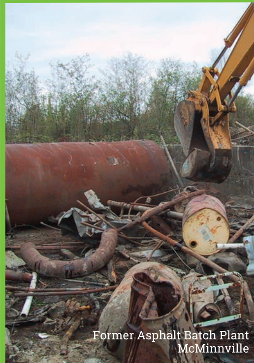
Former Asphalt Batch Plant McMinnville

Cleanup costs and risks deter potential developers and create a barrier to community revitalization and economic development.