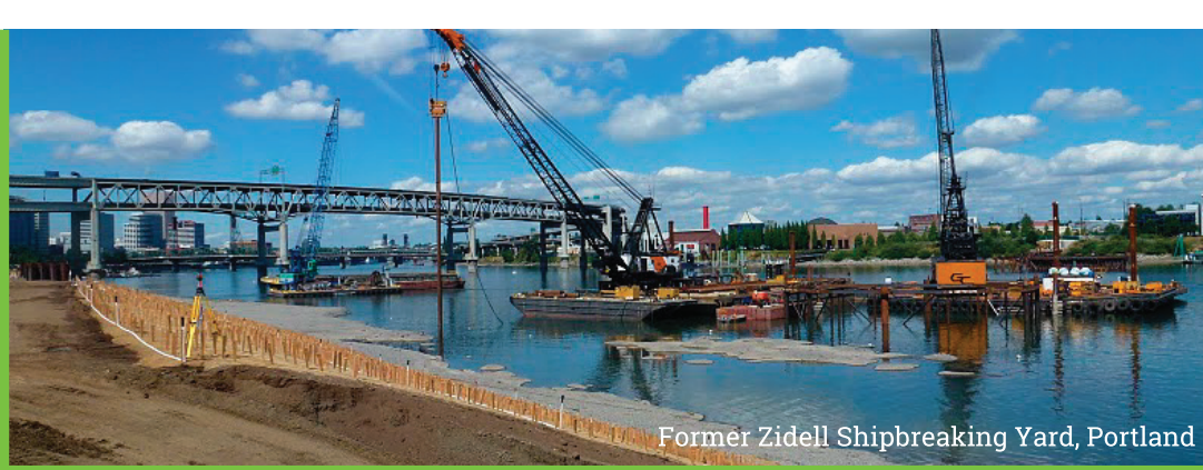
Former Zidell Shipbreaking Yard, Portland