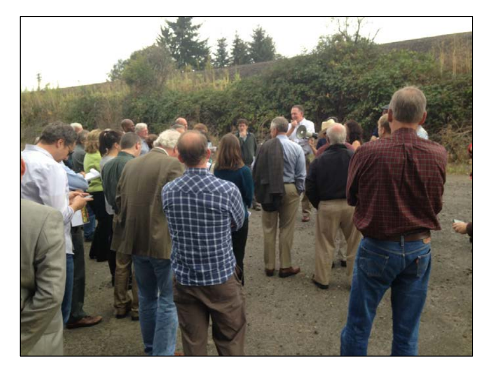
Oregon Solutions partners on a tour the levee system.