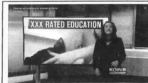
KOIN Investigative Reports: November 18, 2014 through February 17, 2015

*2013 ASC Workshop taught by youth; the "art" was on table as attendees entered workshop