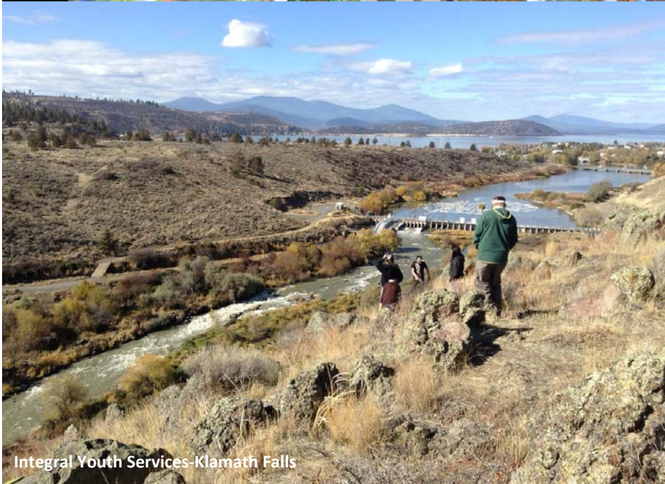
Integral Youth Services-Klamath Falls