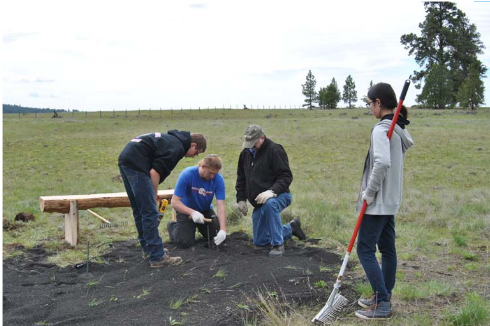
North Fork John Day Watershed Council-Long Creek