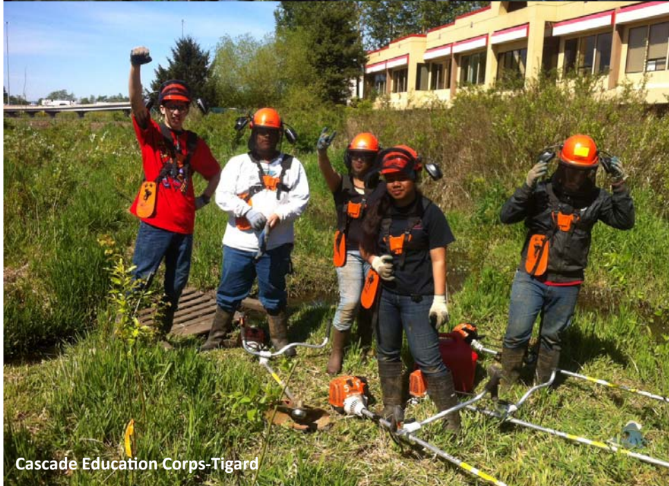
Cascade Education Corps-Tigard