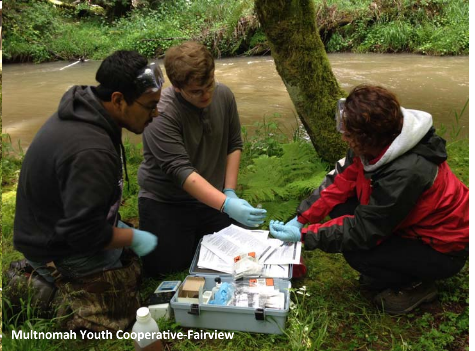
Multnomah Youth Cooperative-Fairview