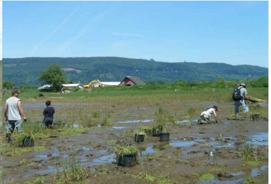
Columbia River Youth Corps-St. Helens