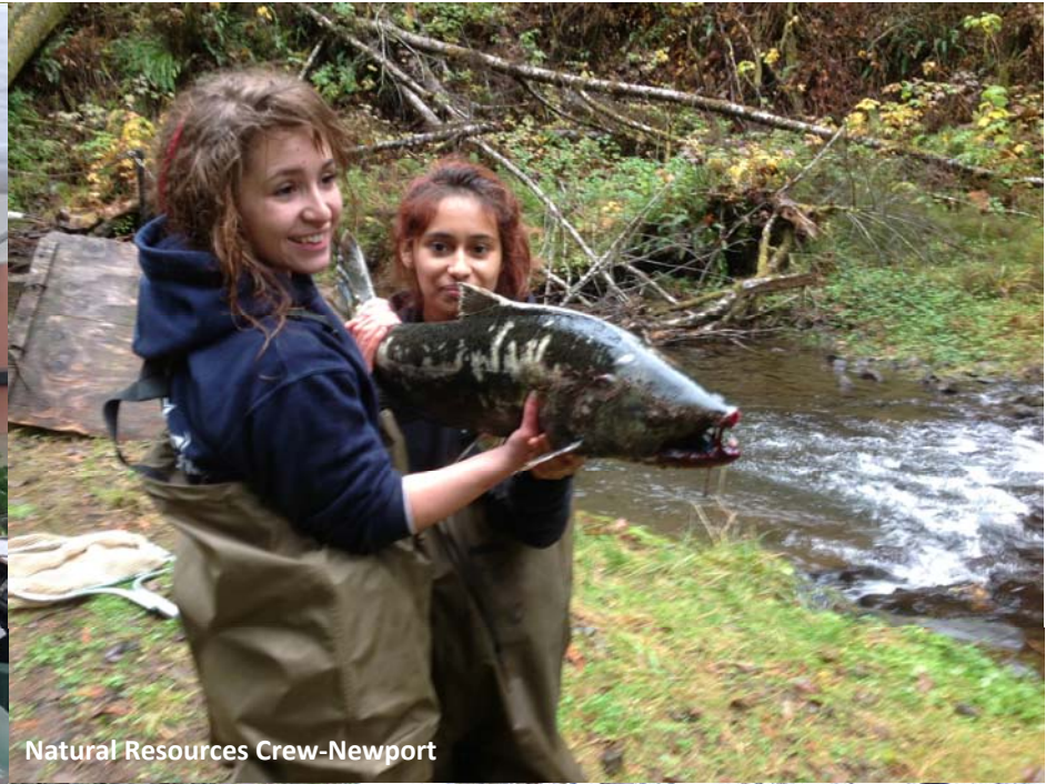
Natural Resources Crew-Newport