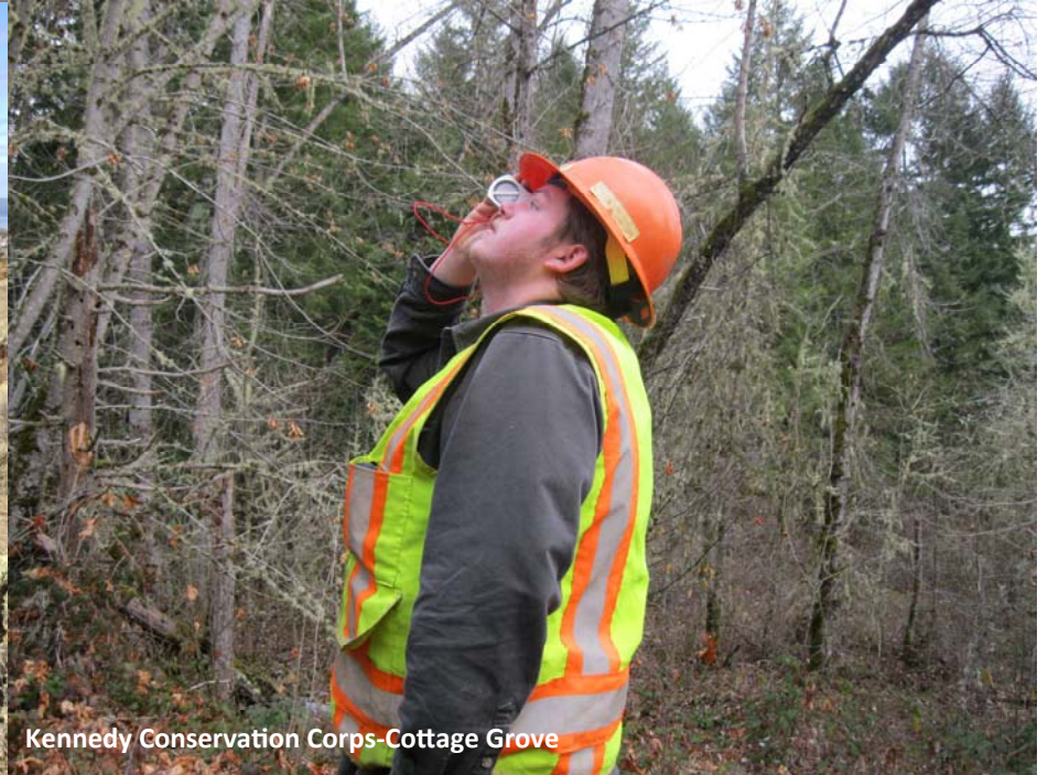
Kennedy Conservation Corps-Cottage Grove