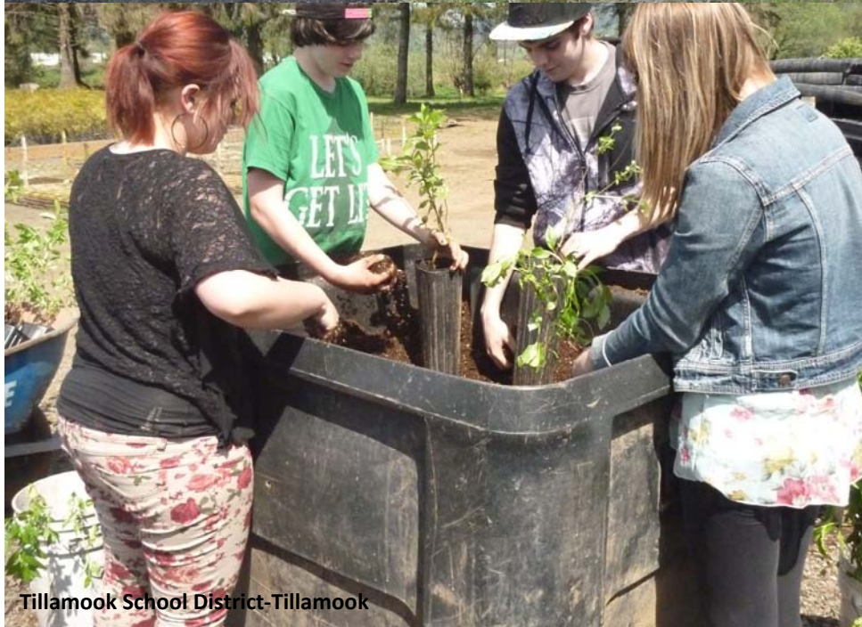
Tillamook School District-Tillamook