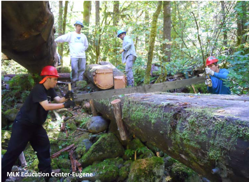
MLK Education Center-Eugene