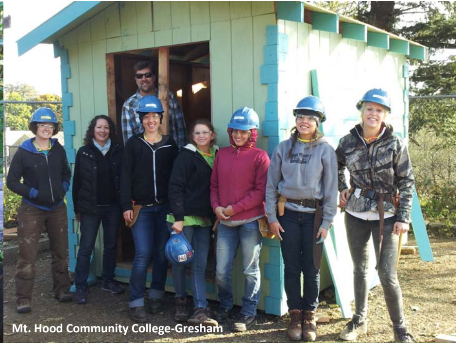
Mt. Hood Community College-Gresham