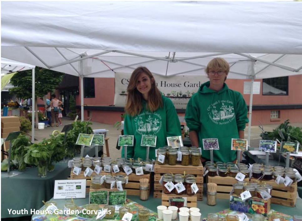
Youth House Garden-Corvallis