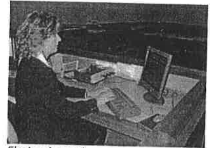
Electronic court reporter

● Public sector or court staff generally obtain initial technical training from the system's vendor when it is placed in service, with further court-specific instruction provided in house.