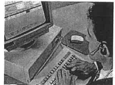
Electronic court transcriber

Although there should be helpful E-Reporter's notes / notations to assist when transcribing, you will bear the ultimate responsibility for correct spellings and, very importantly, final transcript format.