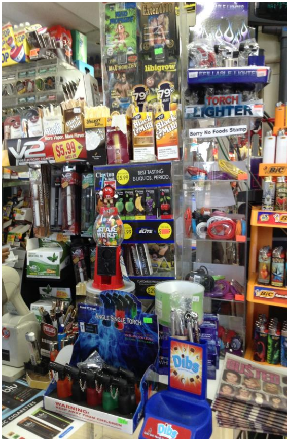
Image from Mult Co Tobacco Retail Assessment