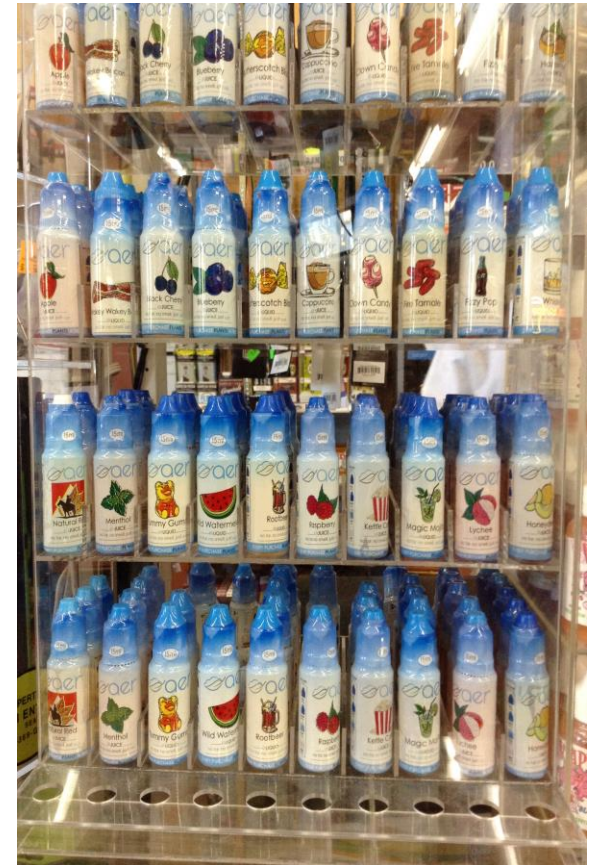
Image from Mult Co Tobacco Retail Assessment

Anyone under age 18 can legally purchase these products in Multnomah County.