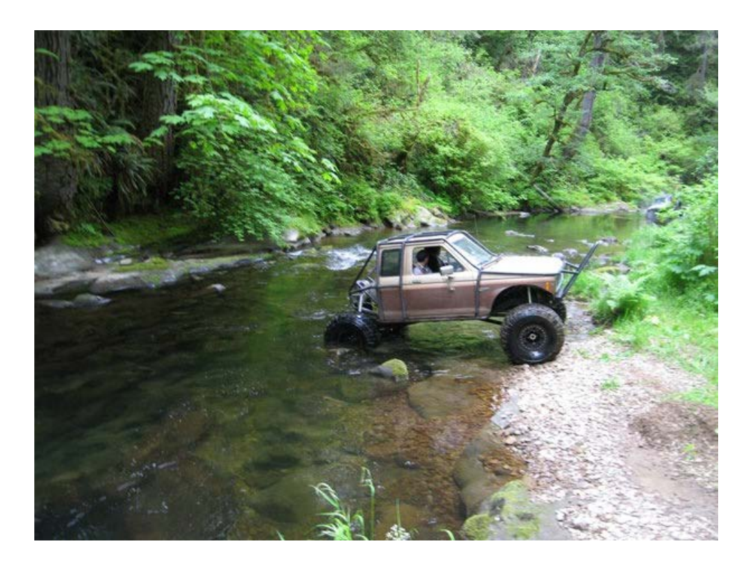
As he was completing his turn around, we saw the second truck driving down the river.