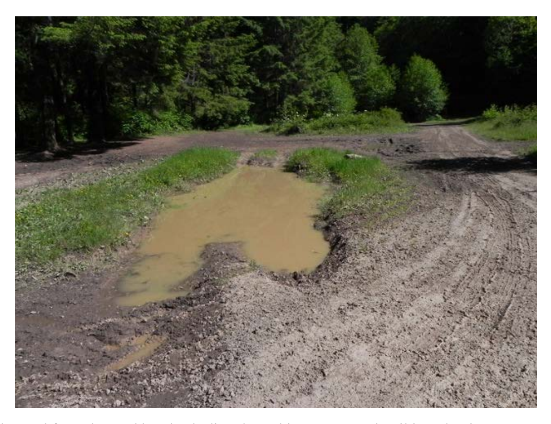
The road from the mud bog leads directly to this user-created trail into the river.

This camping area is just across the 8100 road from the West Fork Millicoma River. Below is a mud bog in the campground that was made for vehicles to drive through for recreation.