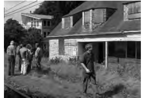
The Historic Preservation League of Oregon drew attention to endangered places, including the Coos Bay's Egyptian Theater (left), Eugene's Civic Stadium (top right), and the Tillamook Bay Lifesaving Station (bottom right).