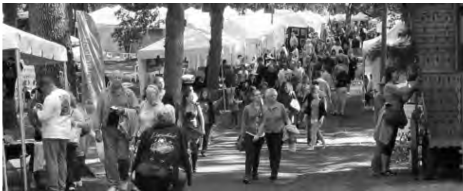
The Salem Art Association’s Salem Art Fair and Festival received support from the Marion Cultural Development Corporation, the coalition in that area.