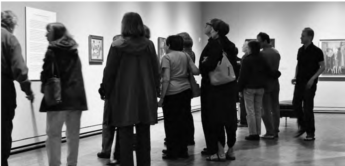
The exhibit Mark Rothko: Portland to New York attracted 88,000 visitors to the Portland Art Museum.