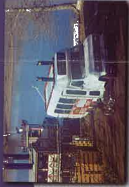
For seniors and handicapped passengers, The Willamette Queen Shuttle now offers transportation from our parking lot down to the boat.

Next time you plan an event think of the Willamette Queen!