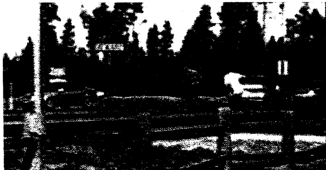
Exhibit 3-2. Pedestrian crossings at 1 st Street.