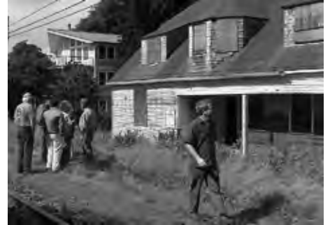
The Historic Preservation League of Oregon drew attention to endangered places, including the Coos Bay's Egyptian Theater (left), Eugene's Civic Stadium (top right), and the Tillamook Bay Lifesaving Station (bottom right).