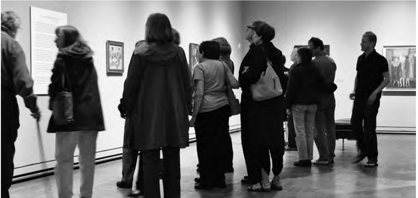
The exhibit Mark Rothko: Portland to New York attracted 88,000 visitors to the Portland Art Museum.