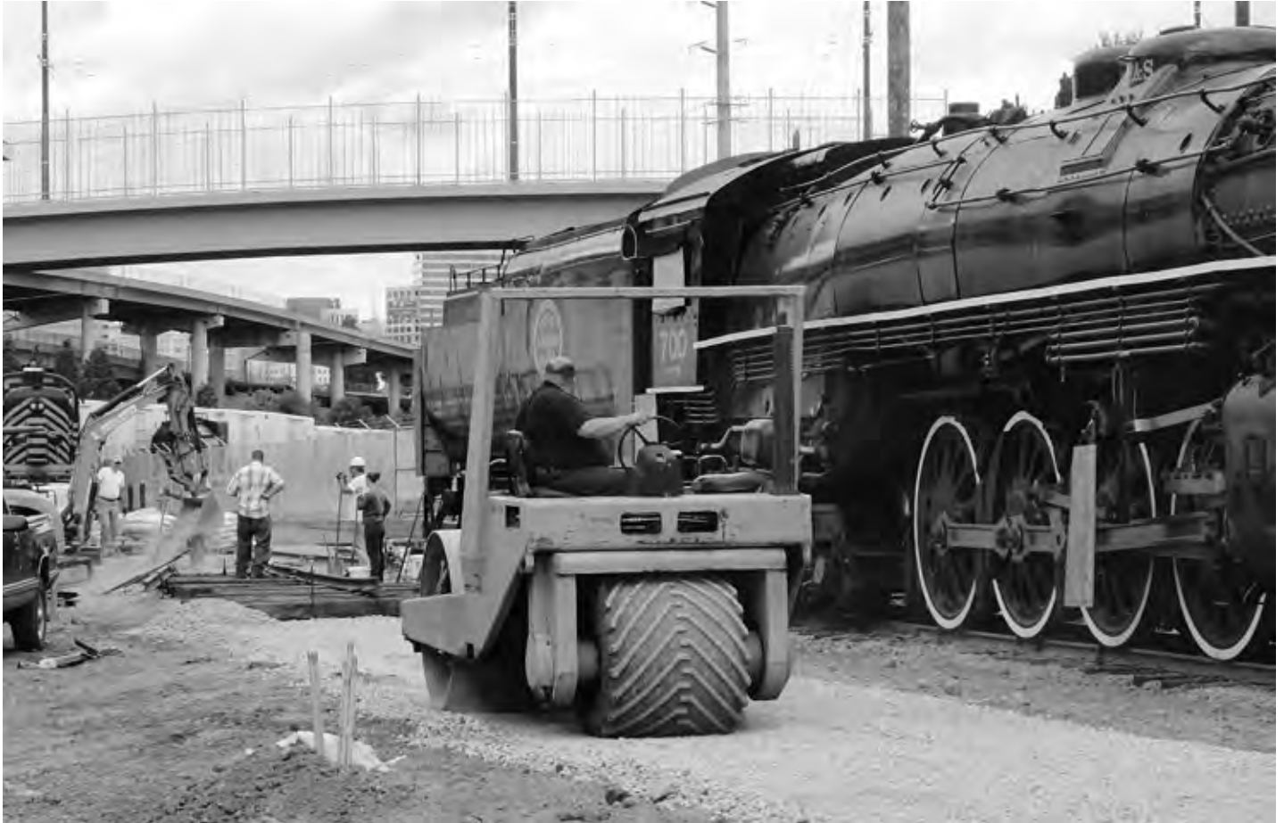
Oregon Rail Heritage Foundation volunteers work on the organization's site on Portland's east side. Locomotive #700 sits on the tracks.