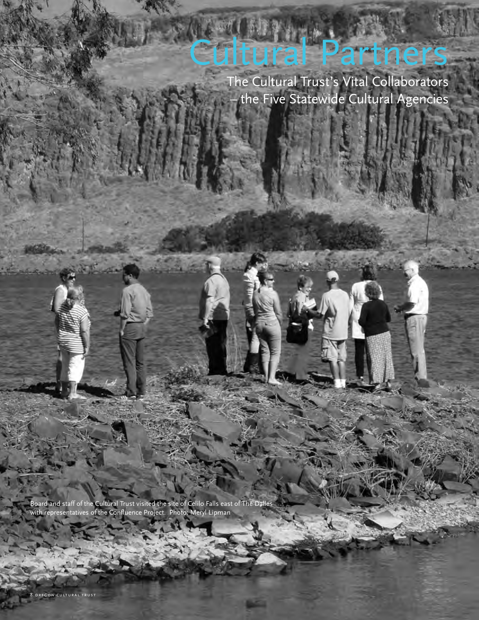
Board and staff of the Cultural Trust visited the site of Celilo Falls east of The Dalles with representatives of the Confluence Project.

The Cultural Trust's Vital Collaborators – the Five Statewide Cultural Agencies