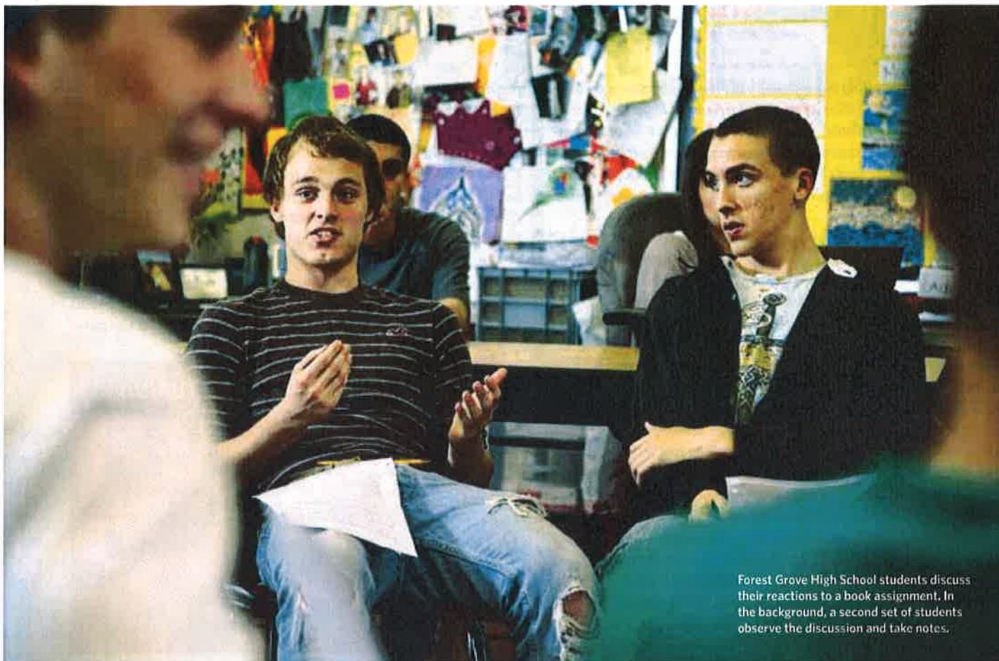
Forest Grove High School students discuss their reactions to a book assignment. In the background, a second set of students observe the discussion and take notes.

While the first year of changing over to a proficiency model was challenging, the benefits have been worth the effort. What at first felt like more work became much smoother with practice. I'm now more confident in grading and more satisfied as a teacher.