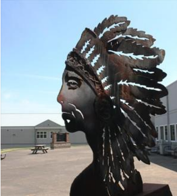
Molalla High School courtyard “Indian”