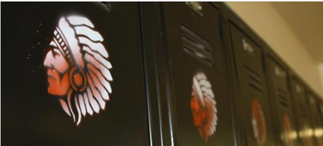
“Indian” spray painted on lockers in Molalla High School