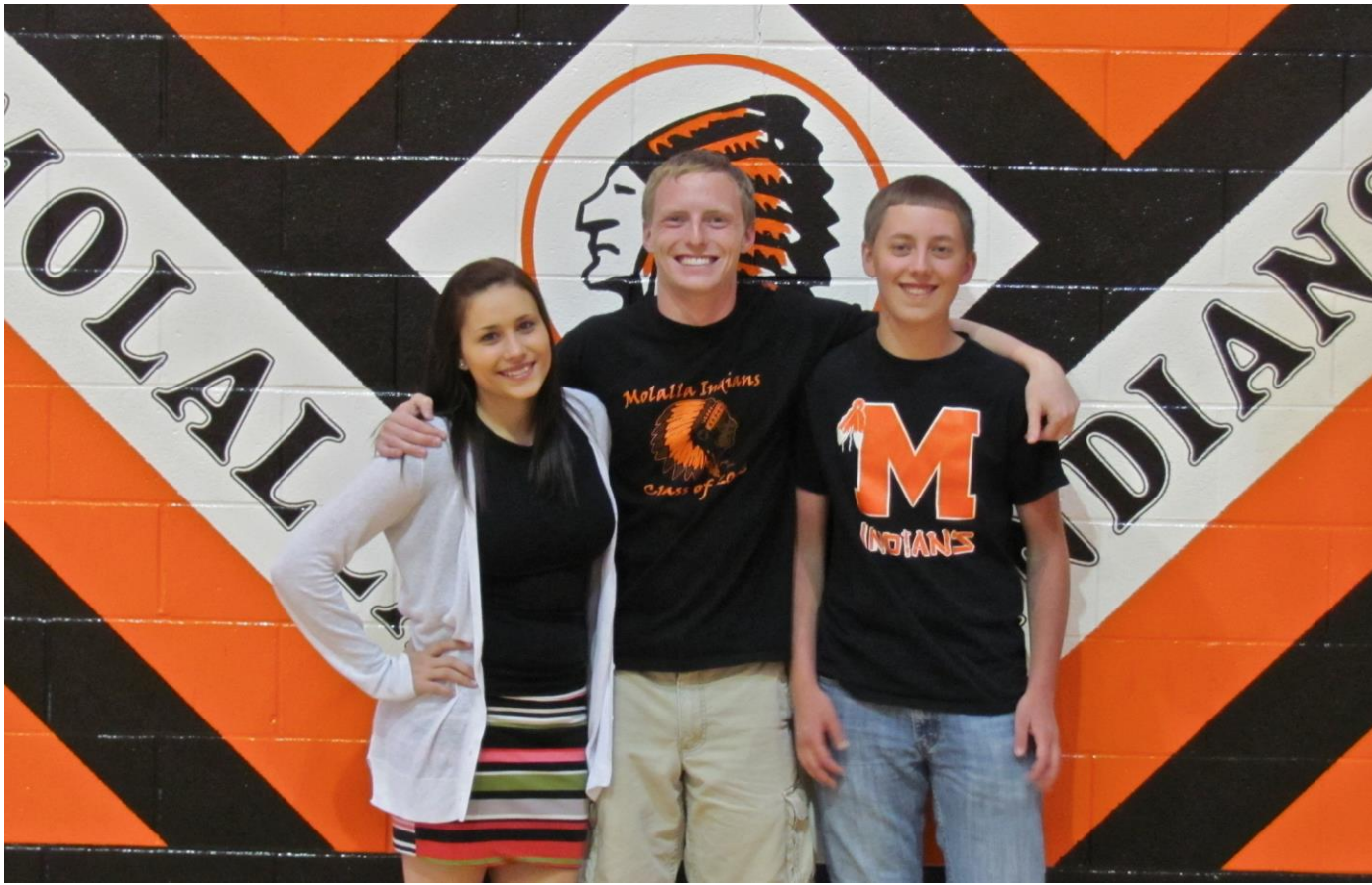
“Indians” in Molalla High School gym, published May 4, 2012 The Oregonian (note two versions of “Indian” tee shirts on male students)