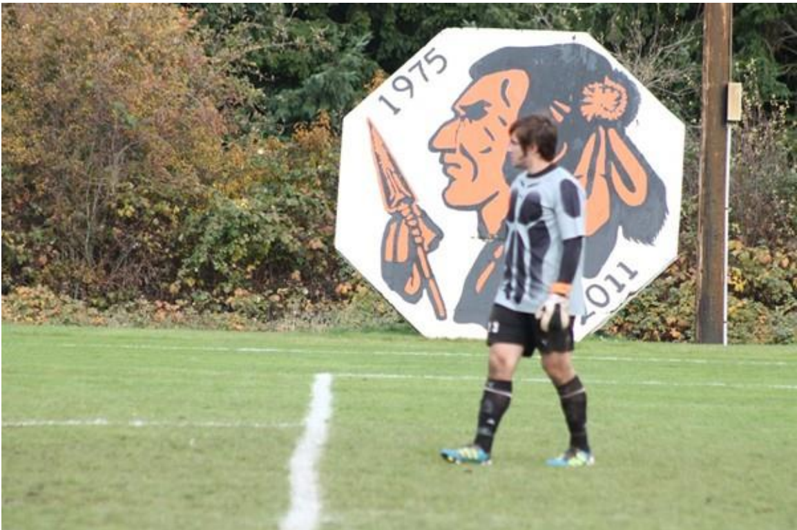
Molalla HS Soccer “Indian” does not match “official” mascot “Indian”