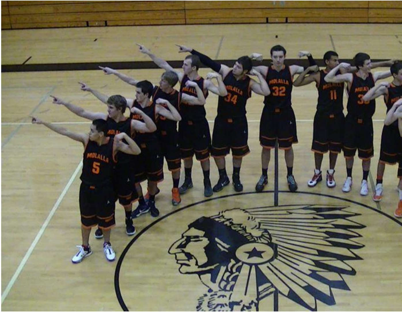
Giant “Indian” on floor of High School gym. It appears that the basketball team is pretending to be using bows and arrows – more “Indian’ fake ritual.