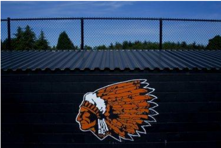
“Indian” on Molalla High School building wall

“ ... (Molalla High School) Indian mascot is still present throughout the school. The logo, a profile of a Native American man with a lined face and headdress full of feathers, is displayed on lockers, painted on the gym's floor and rendered in metal in the courtyard. Arrows help guide visitors through the hallways and drawings of spears decorate the walls. A totem pole and teepee are displayed on the school's soccer field. During a visit earlier this week, two boys walked through the cafeteria, drumming on an empty water jug and chanting.”- Ryan Kost, The Oregonian, May 17, 2012 “With one of nation's strictest rules, State Board of Education bans Native American Mascots”