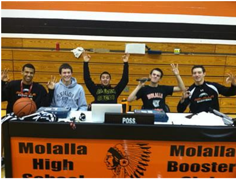
Booster banner featuring ‘indian’