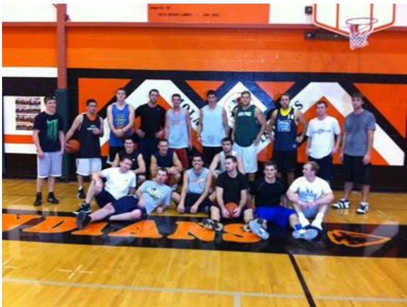
HS Gym – note arrowhead and “Indian” on floor