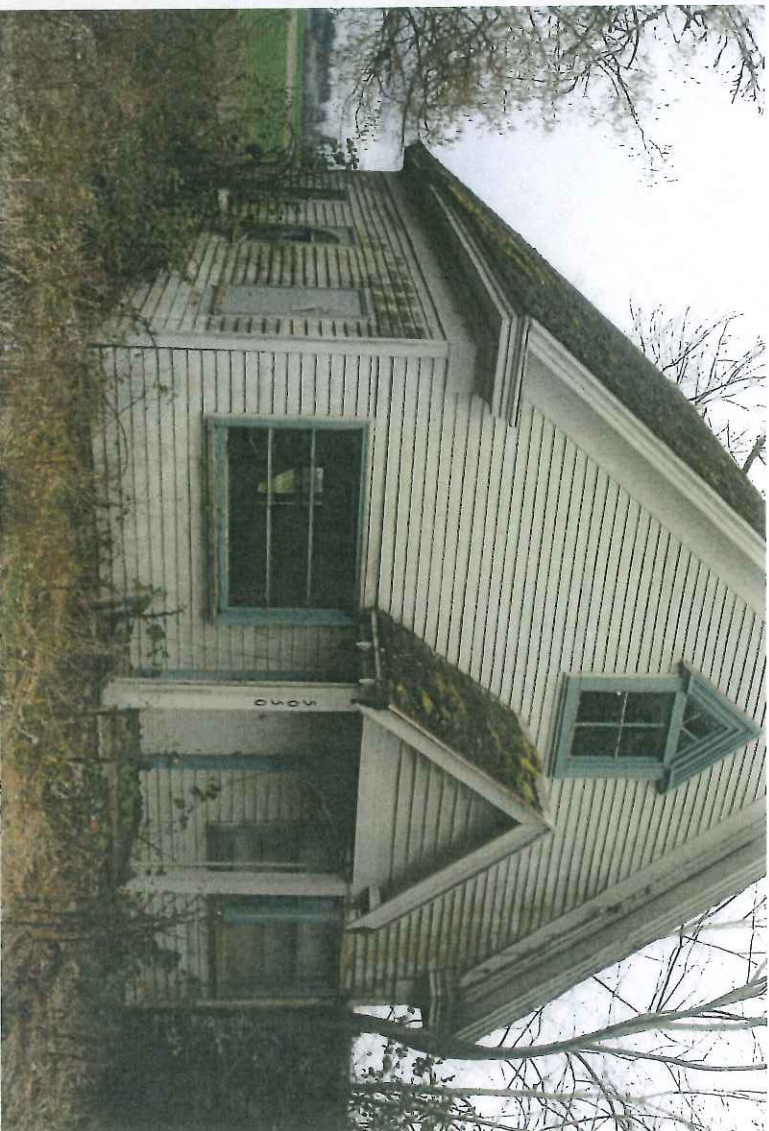
5050 NW Schiffin Rd. Cornelius, OR 34 Acres

Tonges Farms 9095 NW Kerkman Rd. Cornelius, OR 97113