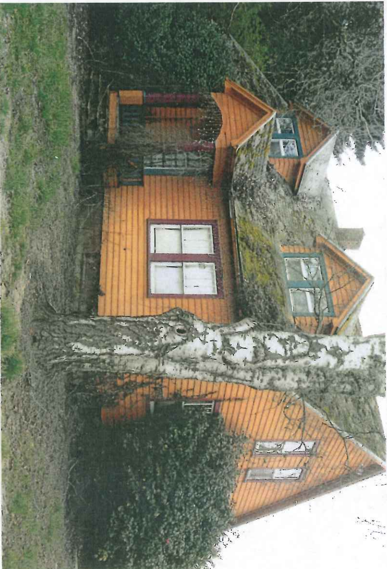
10810 NW Milne Rd. Cornelius, OR 65 Acres