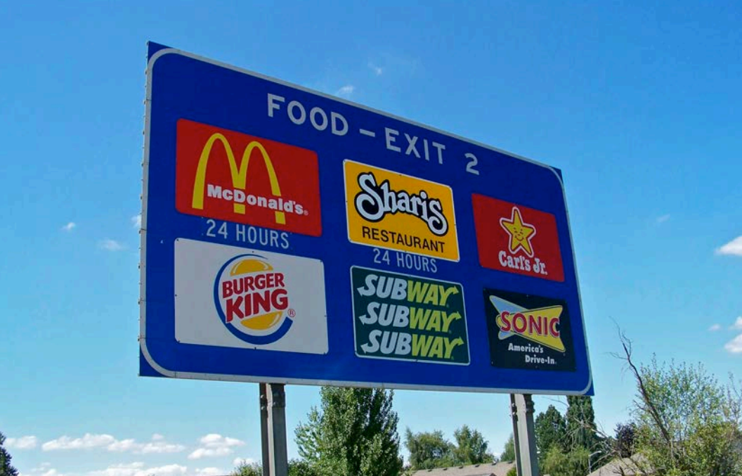
Highway Logo Signs