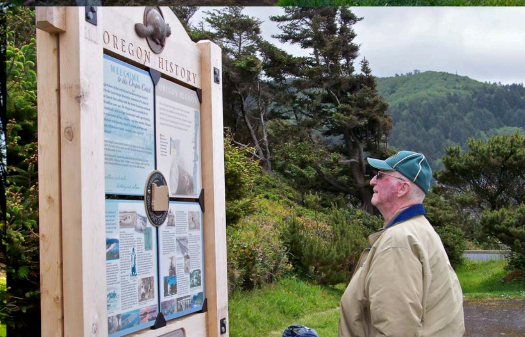
Historical Marker Program