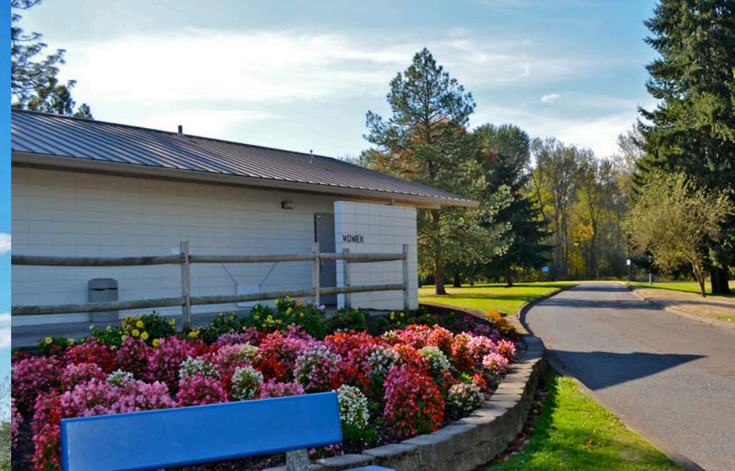
Rest Area Management