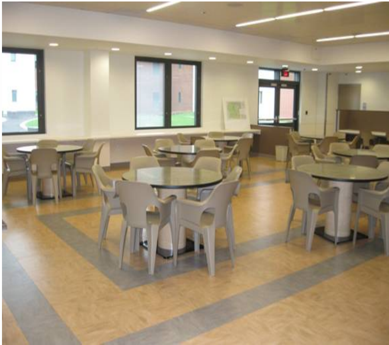
Salem patient dining area