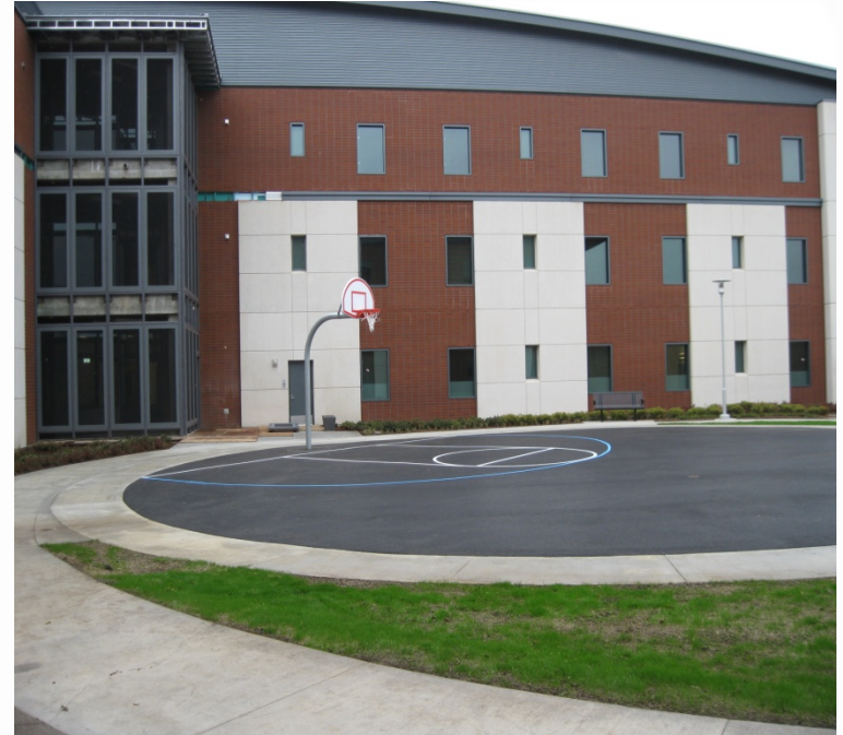
Salem active courtyard