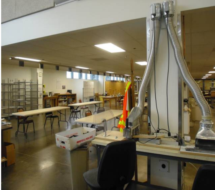
Salem patient vocational area