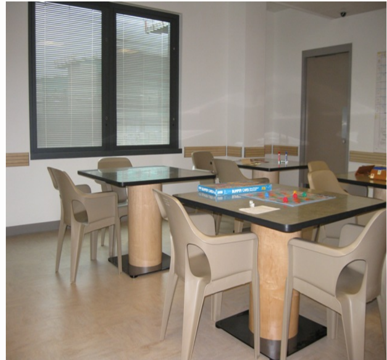
Salem group activity space