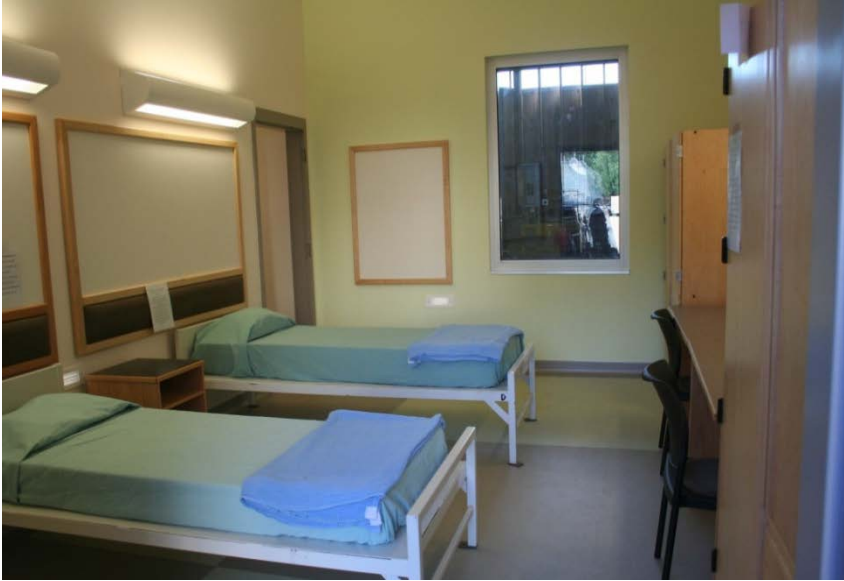
Salem patient room