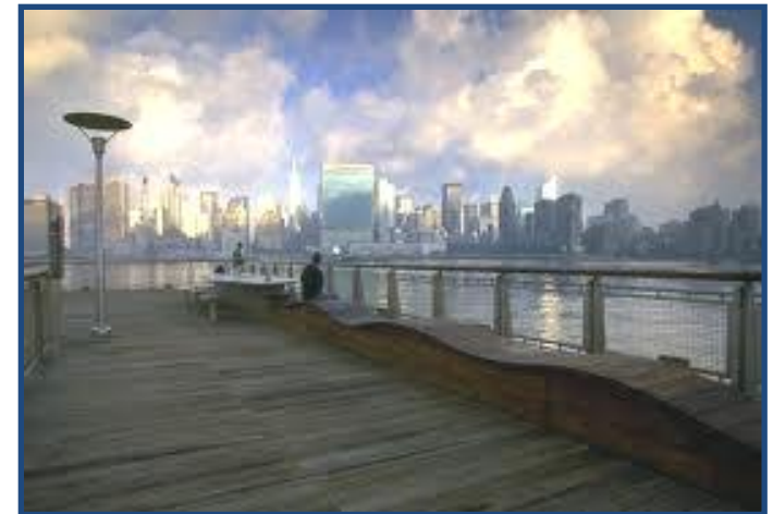
Gantry State Park, Long Island NY