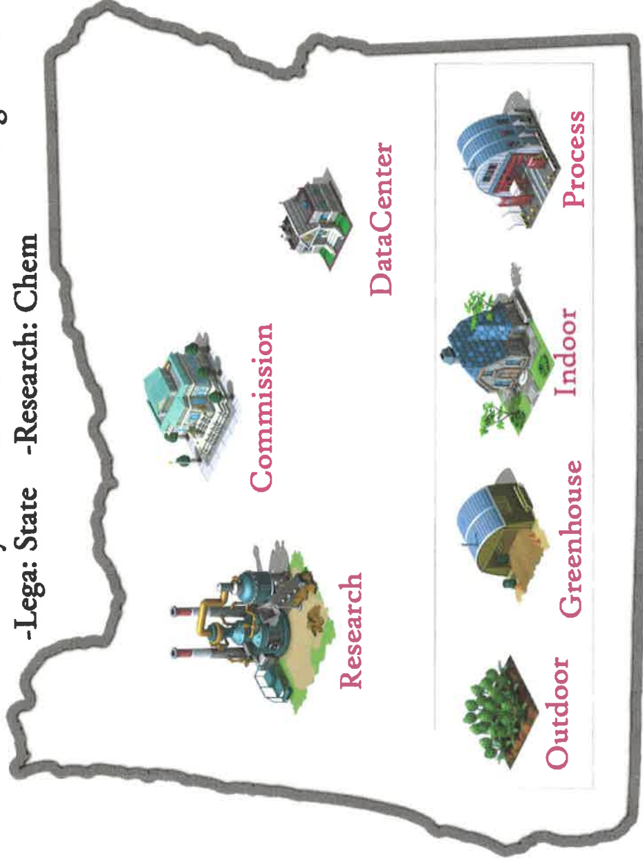
Visual - A